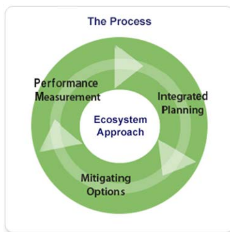
Figure 2 (FHWA 2014d)

The process for FHWA’s system is represented as: