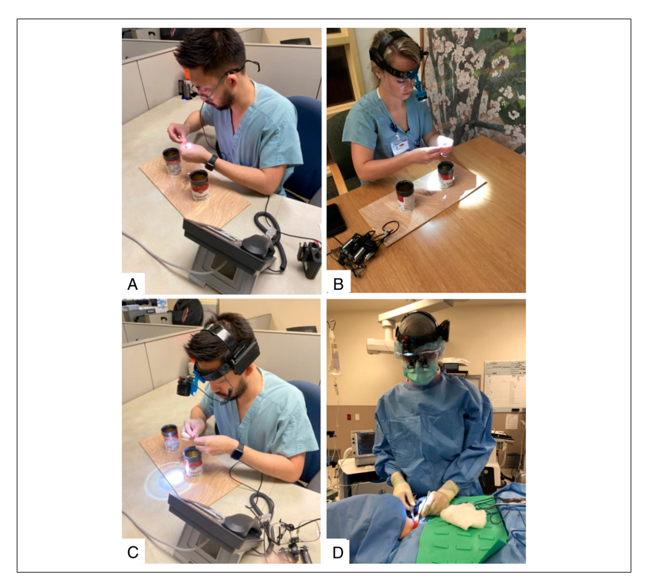
Figure 3. Images of surgical residents testing the headlights: (A) resident with the Surgitel Micro Light Emitting Diode headlight using the surgical simulation; (B) resident with the first headlight using the surgical simulation; (C) resident with the second headlight; and (D) resident using the second device in surgical procedures.