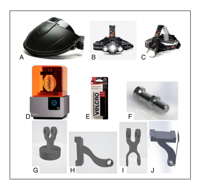
Figure I. Materials for construction of the prototype headlights: (A) rigid headband; (B) commercially available recreational headlight for the first device; (C) commercially available recreational headlight for the second device; (D) 3D printer; (E) adhesive glue; (F) commercially available Velcro; (G) nut and bolt; (H) joint attached for headlight in the first device; (I) joint attached to the rigid headband in the first prototype; (J) joint attached to the rigid headband in the second prototype; and (K) joint attached to the rigid headband in the second prototype.

The first surgical headlight prototype ($50.60) was created using headgear with a rigid headband (Pyramex HGBR Ridgeline Headgear with Ratchet & Pivoting Action, Black by Pyramex; Pyramex, Piperton, TN), a recreational headlight (Cobiz Headlight Flashlight, Cobiz, Seattle, WA), and 3D-printed joints (Formlabs Form 2 3D Printer; Formlabs Inc., MA) (Figure 1). Two 3D-printed (Formlabs, MA) joints