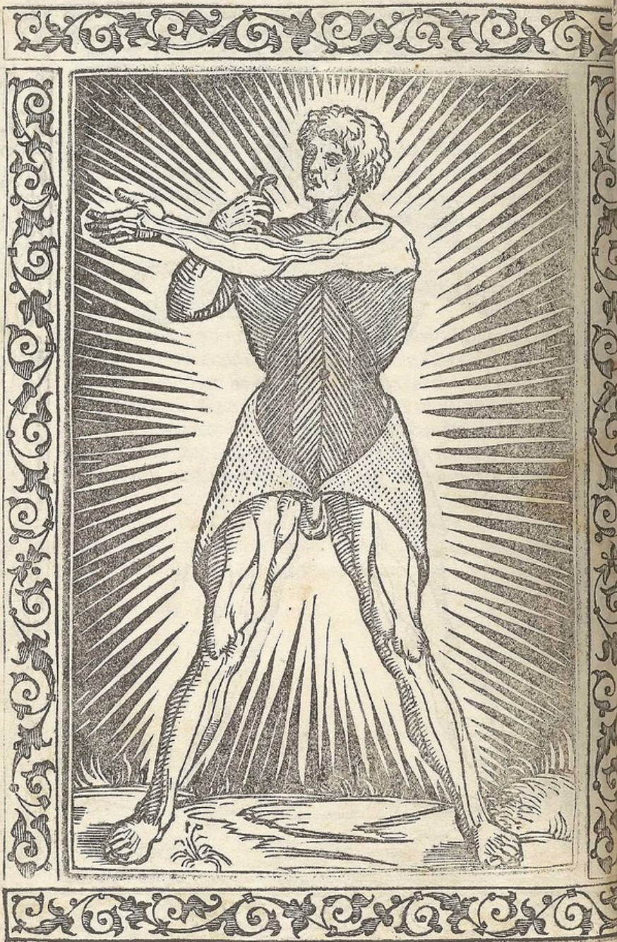
Figure 3. Self-flayer. Hugo da Carpi. Isagogae breues [...], 6v.

In hac fi- gura hęc du- os musculos obliquos ascē- dētesq; se ieru- ciāt cū duob⁹ descēdētib⁹ in alia figura po- sit⁹: qui qdē de- scēdētes sunt supra istos a- scēdētes: ⁊ to- tus vnus ex p- dictis muscu- lis descēdenti- bus supra po- sit⁹ i alia figu- ra cum corda sua superquirit obliq; muscu- lū vnū ex istis ascēdētib⁹ ob- liq; ⁊ faciūt si- mul figurā .x. litterē græce: ⁊ istoz musculo- rū ē pars tar- nea ē a lateri- b⁹: Lorde ho- eoz sunt i me- dio ventris: q; sunt ēt duarū pellicularū: ⁊ hñt vnā pellicu- lā tñ super- quiritē muscu- los lōgos: a- lia vero pellicu- la ē infra mu- sculos lōgos: q; adheret cor- dis latitudina- liū musculoz: ⁊ istae cordae ēt terminant i līnea: q; ē ime- dio ventris: vt vides.