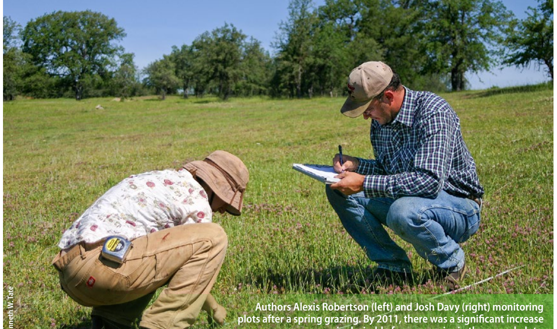
lots after a spring grazing. By 2011, there was a significant increase in desirable forage species in the grazed plots.

treatment between the periods 2006 through 2009 and 2009 through 2011 is potentially explained by three interacting factors: (1) timing and amount of rainfall; (2) timing of cattle removal each spring; and (3) ability of medusahead to recover from grazing and produce seed.