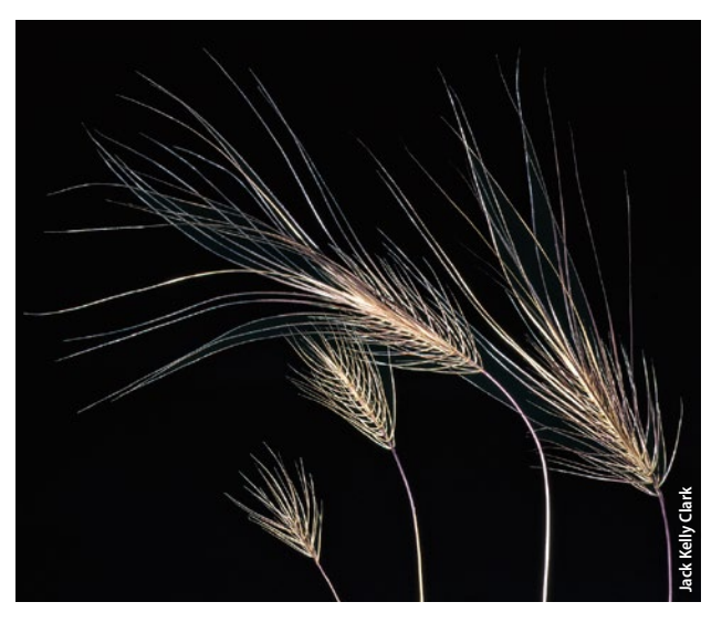
Below , medusahead ( Taeniatherum caput-medusae ) inflorescence with mature fruit.

Right, yellow starthistle (Centaurea solstitialis) flowers at full bloom and seed dispersal stages.