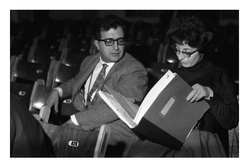
[Fig. 2.2 Berberian and Berio in rehearsal, October 21, 1961.]

historical explosion in feminist and queer scholarship asserts. As Schwartz has noted, her costumes reflexively hyperbolized feminine performance dress, <sup>143</sup> which highlighted the artificiality of performance, and potentially redirected attention toward the performance act itself and the intellectual labor involved in performing challenging repertoire [Fig. 2.2 and Fig. 2.3].