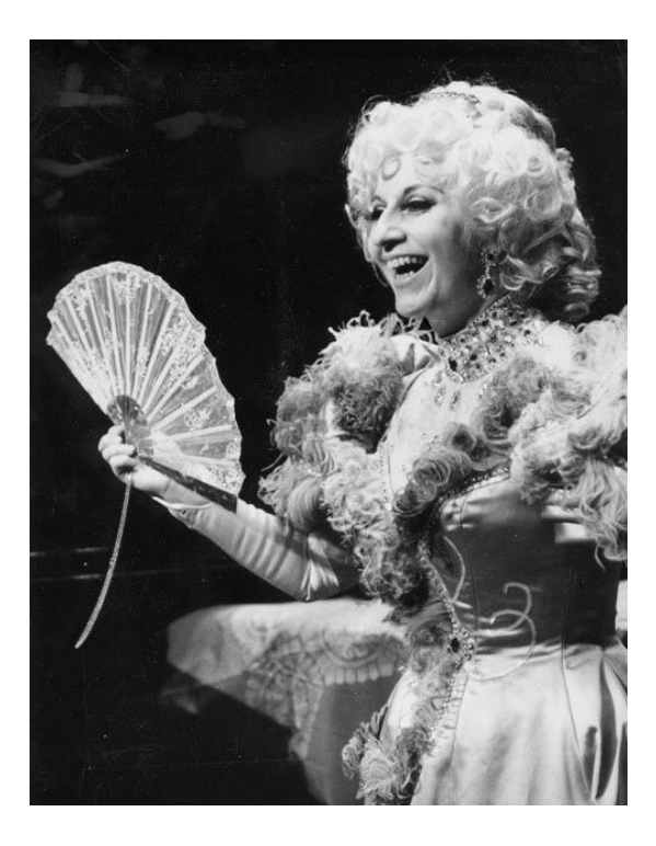
[Fig. 2.3 Berberian in elaborate costume for her September 14, 1973 recital, "À la recherché de la musique perdue" at Town Hall, New York City.]

Thus, even Berberian's theatrical dress could be read as (to use Morgan's words), "Props . . . [that] deploy the body in a way legitimate to the title of thinking," albeit in an indirect fashion. 144