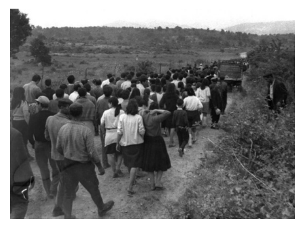
Figure 3.5: Men, women, and children walking to the pastures of Pratobello

the state's attempted interventions (Figure 3.5). For days, men, women, and children gathered to block the targets and intentionally place themselves in harm's way, leaving the military no other choice but to cease fire. Days were spent in the fields, and protestors even received notable support