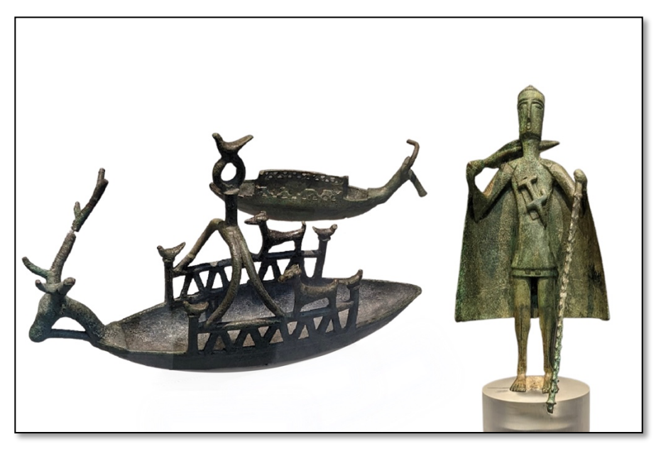
Figure 2.1 : Early Iron Age votive ships and 'bronzetto' figurine of a Capotribù (Chieftain) from Nuragic sites

a Poenis admixto Afrorum genere Sardi non deducti in Sardiniam atque ibi constituti, sed amandati et repudiati coloni. Qua re cum integri nihil fuerit in hac gente plena, quam valde eam putamus tot transfusionibus coacuisse?