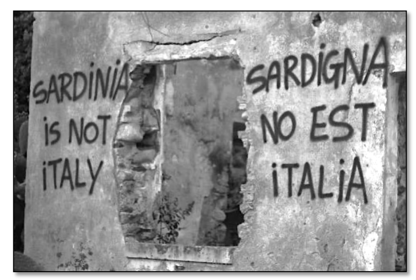
Figure 1.1: Graffito in Nuoro, Sardinia

È doloroso a dirsi...[che] non abbiamo ancora, come dovremmo avere, una Italia...ma due Italie assolutamente diverse: una tutta prospera, tutta colta, tutta progredita, tutta civile; l'altra tutta misera, tutta analfabeta, tutta arretrata, tutta barbara. L'una può dirsi l'Italia <<europea>>; l'altra l'Italia <<africana>>. Una delle parti che formano l'Italia africana è la Sardegna!