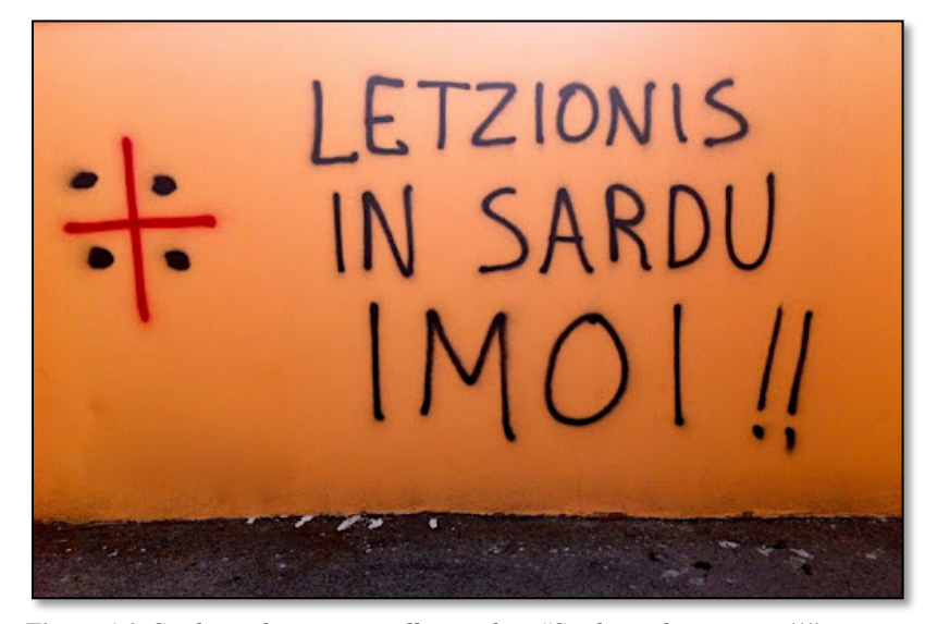
Figure 4.1: Sardinian language graffito reading "Sardinian lessons now!!"

Language is the sheep's clothing which hides the wolf, the dominant culture.