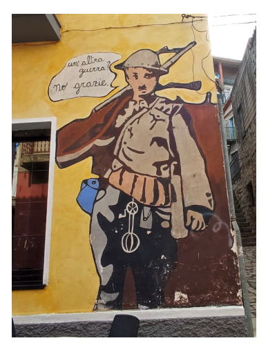
Figure 1.5: Caption reads, "Un'altra guerra? No grazie." ("Another war? No thank you.")