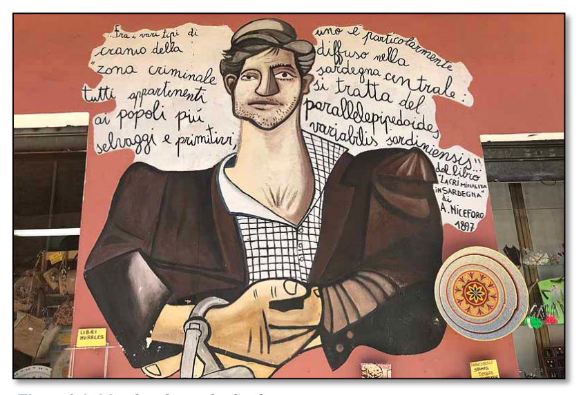
Figure 3.1: Mural in Orgosolo, Sardinia

Resistance Through the Arts: How Sardinia Preserves its Cultural Heritage