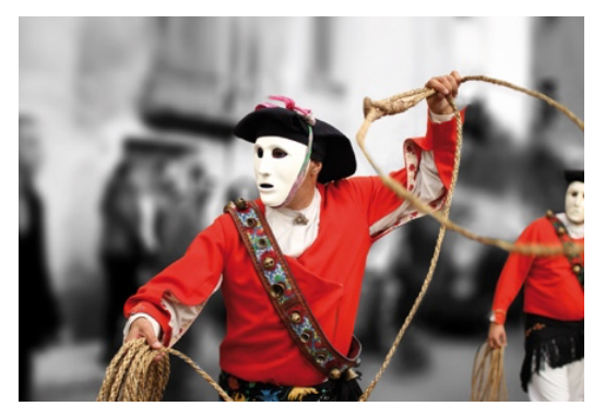
Figure 2.10 (issohadores)

style of polyphonic folk singing still practiced today which dates back to the Nuragic era (Antonaci et al. 3964); or sa strumpa/s'istrumpa , <sup>18</sup> a form of ancient folkstyle wrestling preserved in an Iron Age bronze statuette and still practiced in organized form today