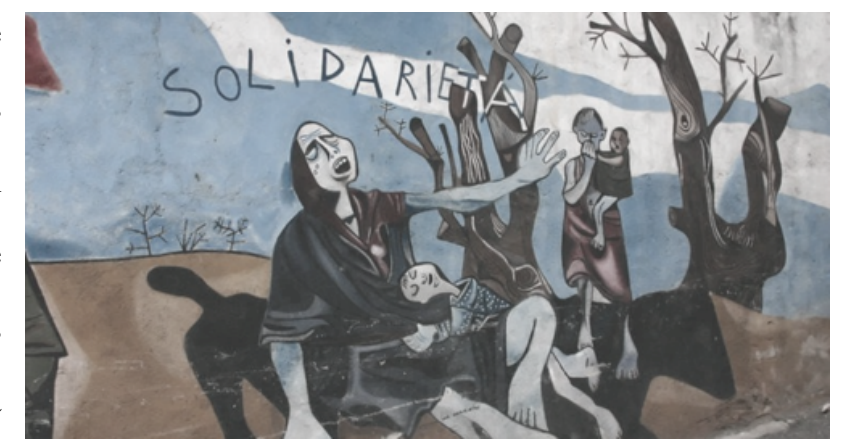
looming question written Figure 3.13

Another mural depicts the end of Saddam Hussein's dictatorship in Iran (Figure 3.14) and the destruction of his monument in 2006 with a