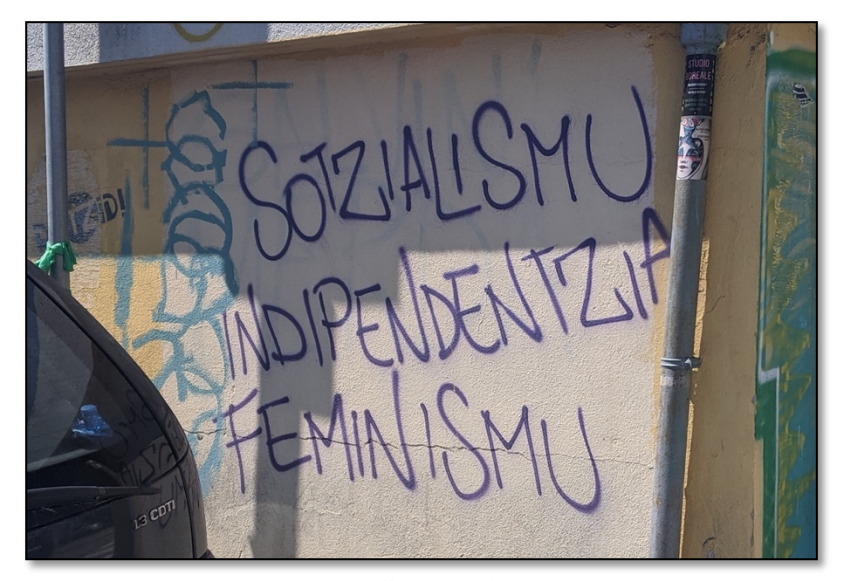
Figure 5.1: Sardinian language graffito in Cagliari, Sardinia

Io so che quando tutto è perduto, o anche soltanto sembra perduto, quello è il momento di ricominciare daccapo.