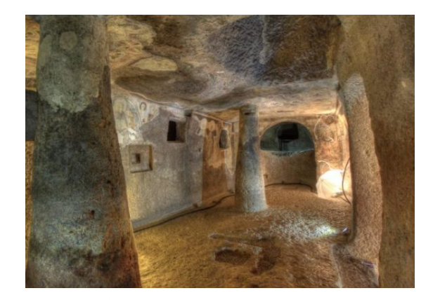
Figure 2.6 (interior)

In terms of structured society, though, seminal Sardinian archaeologist and scholar Giovanni Lilliu points to the Early Bronze Age around 3000 BC for evidence of what he calls the first cohesive nazione sarda (Sardinian nation) ( Costante 338). It is in this period that we see the development of the Ozieri culture which was then followed by the tribes of the Nuragic people (the Ilienses, Balari, and Corsi) who inaugurated the period of organized labor, technical and artistic advancements (see Figures 2.7 and 2.8 for bronze votive ships and Nuragic military figure statuettes, respectively) and a common language