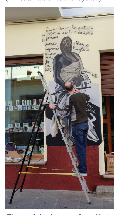
Figure 1.6: Image of a Native American woman with the caption (in progress), "L'uomo bianco ha portato un pezzo di carta e ha detto di firmare. Quando abbiamo imparato l'inglese, ci siamo accorti che con quel documento..." ("The white man brought a piece of paper and told us to sign it. When we learned English, we realized that the document...")

sentiments and Figure 1.6 for a work-in-progress alluding to the struggle of Native Americans).