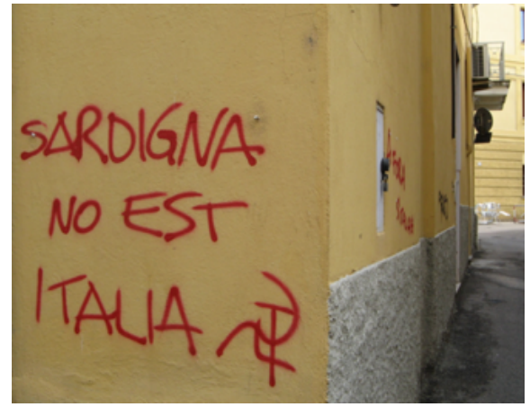
Figure 4.6 Figure 4.7

While the minoritization and notable decline in the use of Sardinian dialects throughout the 1950s and -60s encouraged communal efforts to preserve the indigenous varieties, such linguistic movements gave rise to new in-group complications. Organized efforts at linguistic preservation began with the resurgence of the movement termed neo-sardismo led by the Partito Sardo d'Azione (Psd'Az, Sardinian Action Party) in conjunction with a series of other organizations like Sardinnya et Libertat (Sardinia and Freedom), Democrazia Proletaria Sarda (Sardinian Democratic Proletariat), and Su Populu Sardu (The Sardinian People) (Hepburn 600). The ethos of this collective push was an update to the socialist sardismo movement of the post-First World War era which called for regional self-determination. The focal point of this movement was a demand for the instruction of Sardinian in schools, as well as its use as the official language of public institutions and local media. The linguistic dimension was a particularly new addition for