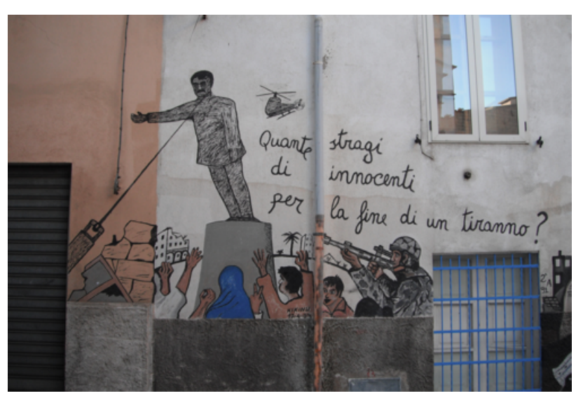
over the heads of Iranian citizens in the crowd: Quante stragi di innocenti per la fine di un tiranno? (How many massacres of innocent people before the end of a tyrant?).