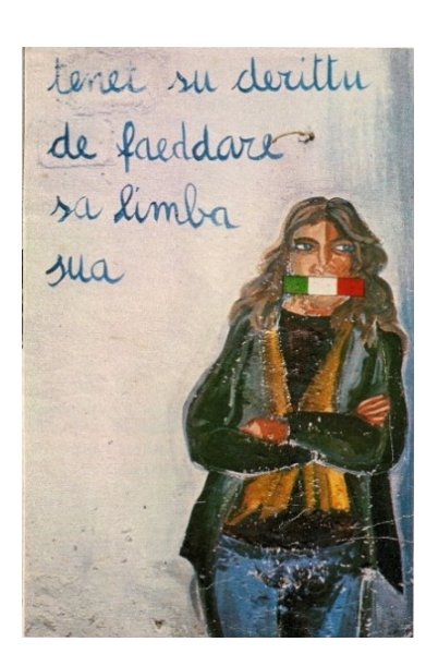
Figure 1.7: Mural depicting a young Sardinian with the Italian flag, meant to symbolize the imposition of the standard Italian language, covering their mouth. The text is in Sardinian and reads, "tenet su dirittu de faeddare sa limba sua" ("hold on to your right to speak your own language")

This chapter also covers language as a critical tool for governing elites in the maintenance of power, a notion well-understood and acknowledged by Sardinians (See Figure 1.7). The sociolinguistic issues are rooted in Italy's mission to standardize a national language in the lead-up to unification, though they extend well into the post-war period with Fascism's lingering policies which banned the use of Sardinian dialects being compounded by the opportunity for social and economic mobility tied to speaking standard Italian. Chapter 4 concludes with a closer look at how language still plays a major role in Sardinia's policymaking today, with the Italian Republic acknowledging Sardinian as