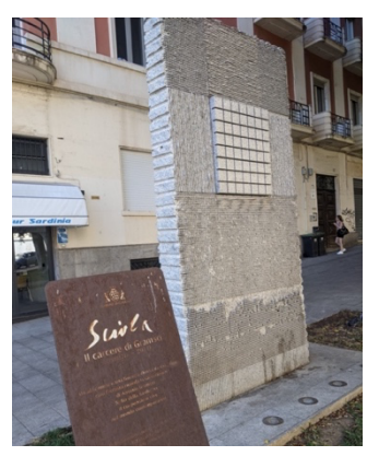
Figure 3.27 Figure 3.28

Accompanying it is a plaque that reads: Il carcere di Gramsci. Un alto muro e una finestra chiusa da una grata: così l'Artista ricorda la carcerazione di Antonio Gramsci, figlio della Sardegna, il cui pensiero vive nel mondo contemporaneo. (Gramsci's prison. A high wall and a window closed off by a metal grid: This is how the artist depicts the incarceration of Antonio Gramsci, son of Sardinia, whose thought lives on in today's world.).