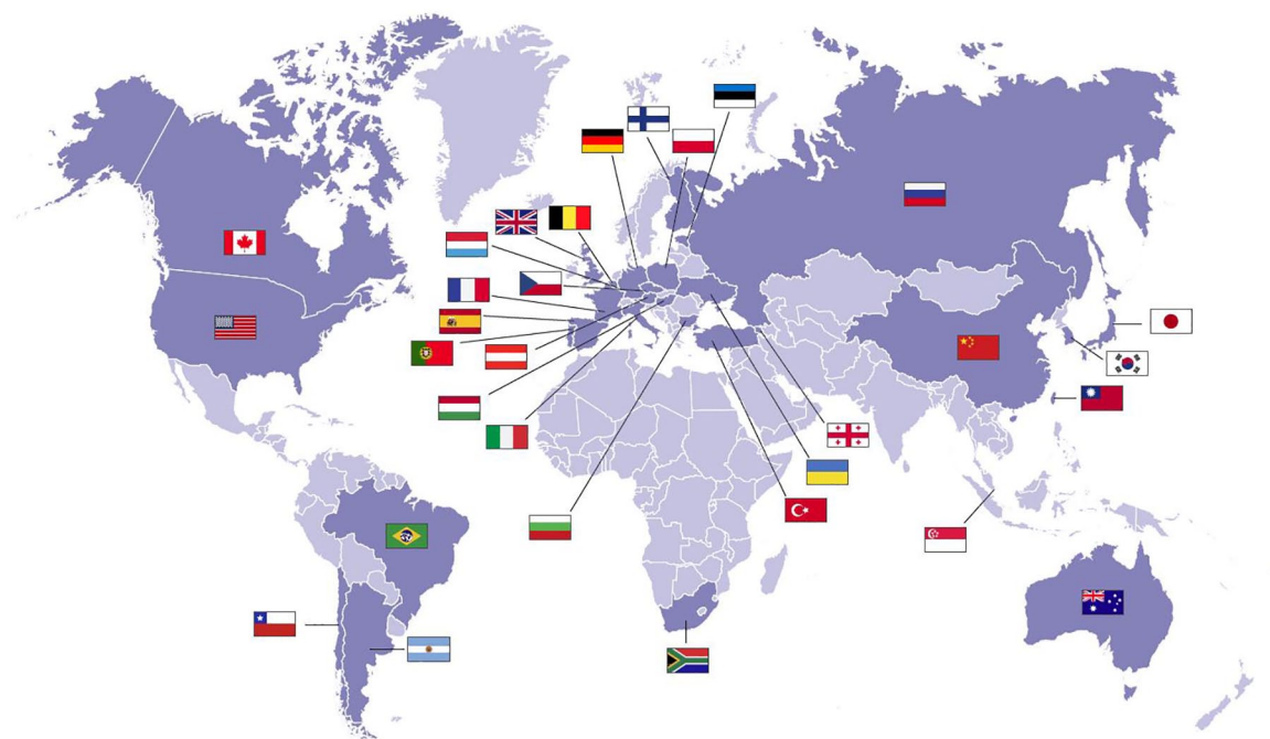
Figure 3. Countries with AMEERA-5 planned enrollment sites.

amendments, and other relevant documents have been approved by the Institutional Review Board/Independent Ethics Committee at each study site (Supplementary Materials). Written informed consent will be obtained from all patients prior to enrollment.