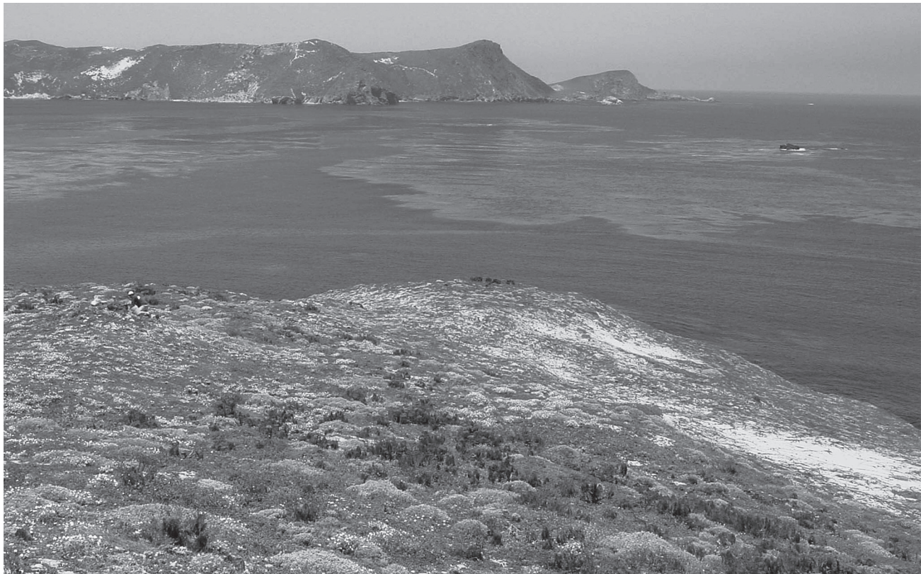
Figure 2. Portions of the CA-SMI-161 site complex looking northwest. Person excavating in left center of photo is at Unit 2.

Middle Holocene, but radiocarbon dating of an extensive midden on top of the terrace on the site's eastern margin also documented an occupation dated to around 1,350 cal B.P. (Table 1).