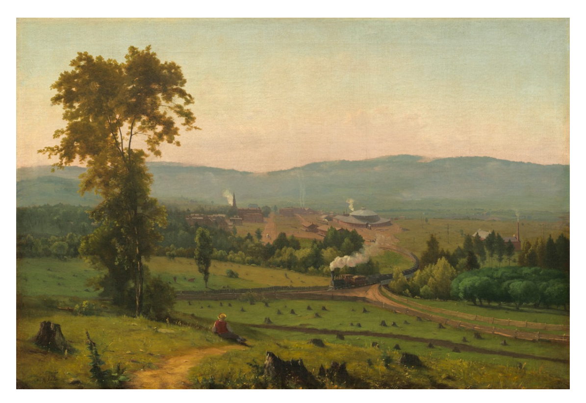
Figure 2. George Inness, The Lackawanna Valley

second revision Kant makes, the sublime ceases to be ego-shatteringly anti-human. The key moment of the sublime in his analytic is not the overmastering initial experience but the return of the mind to a sense of control. Kant takes the experiential content of the sublime, that of self-effacement in the confrontation with that which exceeds our cognitive and intellectual capacity, and argues that the sublime moment is not one of devastation of the ego but of rescue from that devastation that results from the understanding that the mind is attempting to do something that is simply cannot do. In doing so, he wants to bring the sublime under control as it were. This is because he recognizes that an anti-human sublime, a "wild and savage" sublime, threatens his transcendental idealism. Kant is interested in the sublime then not because he wants to highlight