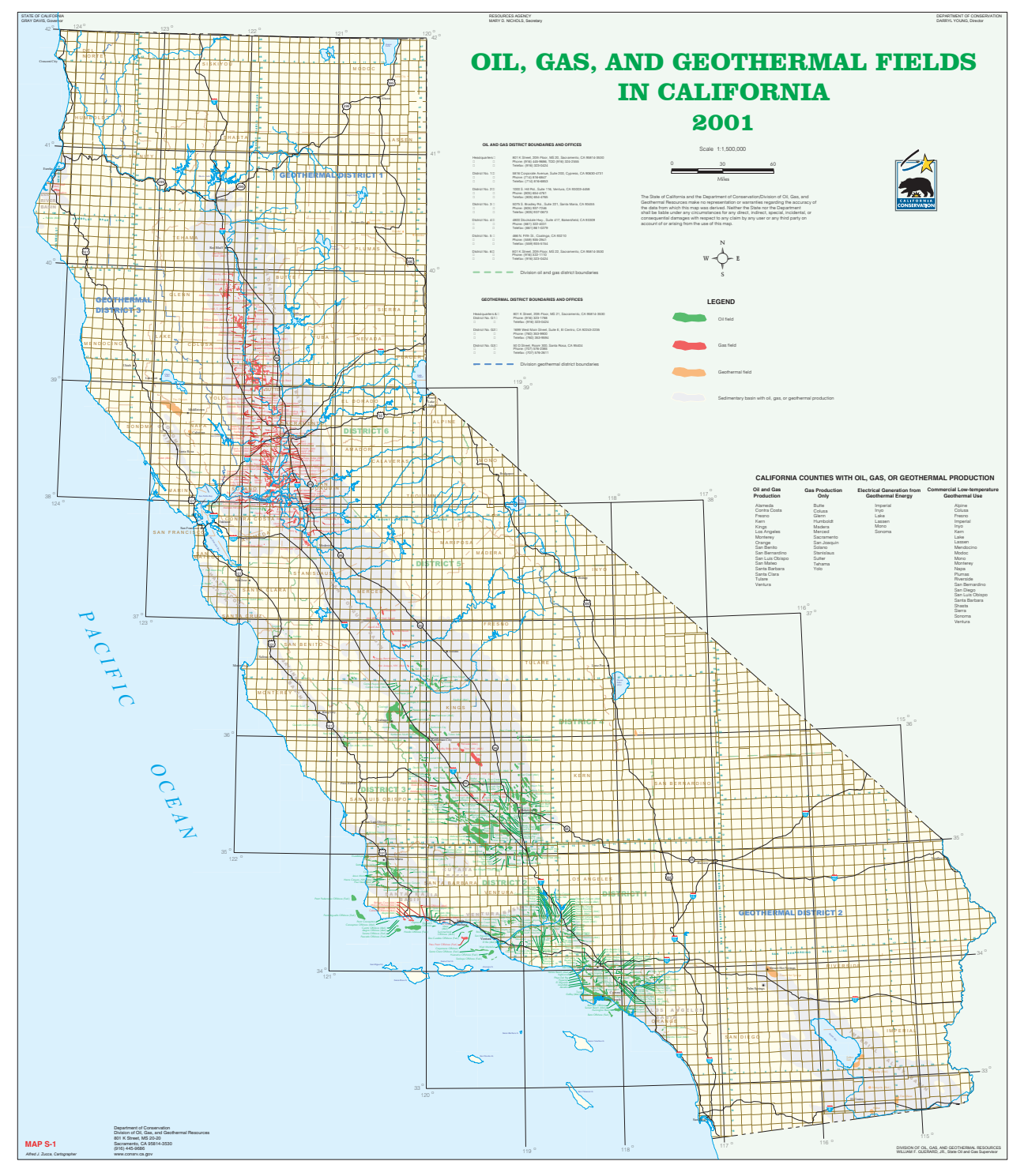
Figure 1: Oil and gas fields in California.<sup>315</sup>