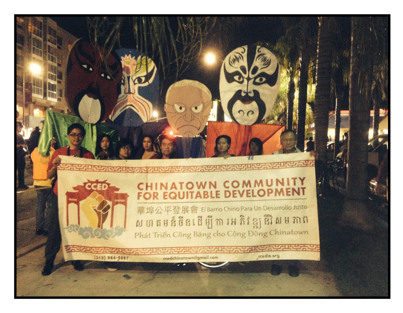
Figure 1.2. CCED members at the November 7, 2013, action wielding the cardboard Beijing opera masks—which represented famous heroes from Beijing opera—and a papier-mâché personification of Walmart. Masks/puppets from left to right: Guan Yu (red), Zhongli Chun (blue), Walmart puppet, Liu Bei (white).

warrior famed for cleverness; Guan Yu, a warrior general known for loyalty and righteousness; and Liu Bei, a warrior emperor associated with benevolence and humanity.<sup>79</sup> The visuals also featured a cartoonish puppet of Walmart made to look villainous (see Figure 2).