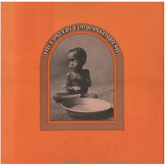
Figure 2. Concert for Bangladesh Poster

The Concert for Bangla Desh was the first of its kind to combine rock music, the spirit of 1968, and the politics of postcolonial South Asia. As such it became a pioneer in the new rock activism of the 1970s. First, following in its wake, the rock scene became connected to postcolonial issues. The rock scene mobilized support, awareness, and funding of youth for a postcolonial cause and solidarities in the aftermath of European empires. And it served as an inspiration for other events devoted to postcolonial issues like the Concerts for the People of Kampuchea , for example, organized in December 1979 in London by former Beatle Paul McCartney to raise money for the victims of the Pol Pot regime in Cambodia. Second.<sup>666</sup> building on the success of British rock and punk music in the United States —what some called the "British invasion"— this rock activism offered new links between music and political and social issues in the Anglo-American world. British rock brought a new culture and critique of social and political issues and spread them to the United States and beyond. It forged new collaborations between British and American musicians, from which Band Aid and later Live Aid would later draw (See figure 2).