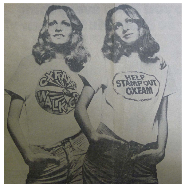
Figure 5. Twiggy in a poster to promote Oxfam's Walk, 1969.

The walk was a huge success and the biggest up to that date. It represented a shift in the support base of humanitarian charities. Instead of the older, Christian charities, which grudgingly claimed they "felt that Sunday is being used too much for such thing,"<sup>644</sup> the walk received a huge response mostly from the British youth. Through that Pegram and his crew have managed to raise more than £250,000 for Oxfam in just one afternoon.<sup>645</sup> Beginning from eleven centers across London's boroughs, the walk included celebrities such as Britain's Olympic gold medalists hurdler David Hermery and the actress Sheila Hancock.<sup>646</sup> Walking barefoot and in a temperature of 82 degrees,<sup>647</sup> however, the walk represented – as the Liberal MP Jeremy Thorpe called them, "Britain's young volunteer army."<sup>648</sup> In newspapers and on television young people became the face of Oxfam's walk in the late 1960s.<sup>649</sup>