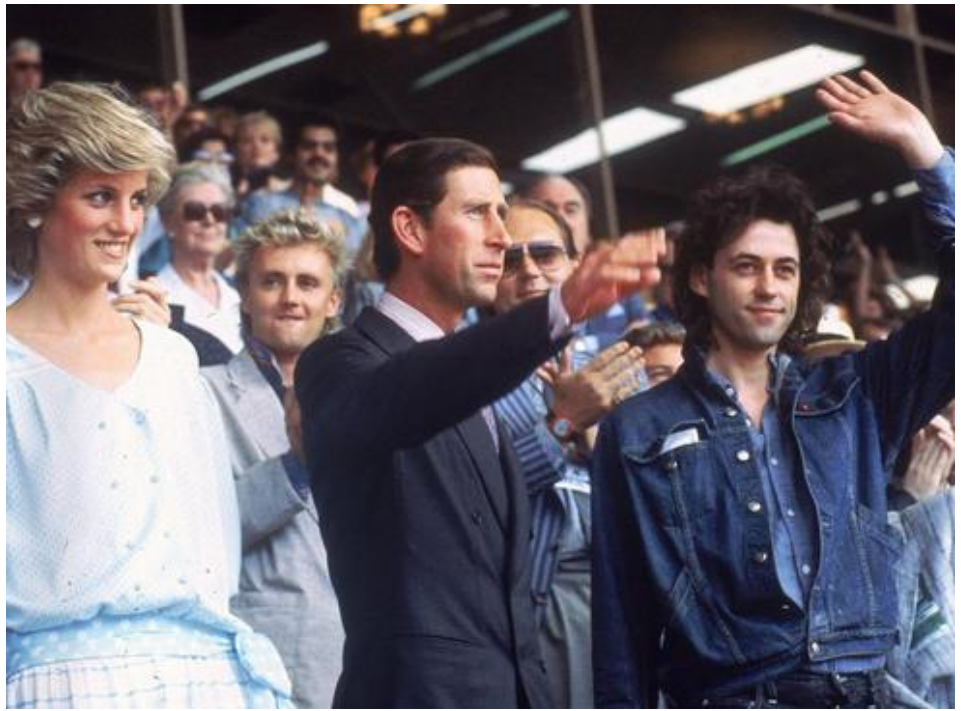
Figure 5. Princess Diana, Prince Charles and Bob Geldof at Live Aid

The reach of Live Aid made regular songs into global anthems. Queen's "Radio Ga Ga;" U2's 12-minute version of "Bad"(See figure 6) for example became famous for their Live Aid versions. "It was like dropping a pebble in a pond, and the ripples were huge," said Midge Ure. "The average guy on the street felt connected to making a