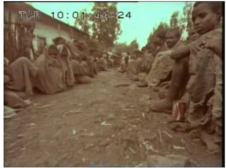
Figure 3. Shot from the Richard Dimbleby's Unknown Famine.

But Dimbleby's film was also emblematic of a more general representation of humanitarian disasters in the news prevalent during the 1970s and 1980s. It prioritized a sensationalist narrative of natural disasters rather than contextualizing famines in the political economy from which they emerged in postcolonial Africa. In the mid-1960s Oxfam had been denied from passing an appeal in the BBC about mass drought and famines in Kenya, Bechuanaland, Basutoland, Swaziland, and Rhodesia on the eve of independence.<sup>613</sup> By the early 1970s the BBC, like much of the global media, centered its attention on the plight of famine victims in postcolonial Africa. A new media logic had emerged in which the idea of an emergency became more prevalent in the news than other programs of irrigation programs and development of various local infrastructures.<sup>614</sup> As the next sections will show, this new media logic also began focusing on new segments of the population, or rather specific "target groups" —i.e. children and youth. The new culture of aid began including and catering for children and teenagers in their campaigns, in the attempt to introduce them from early age to the plight of global suffering.