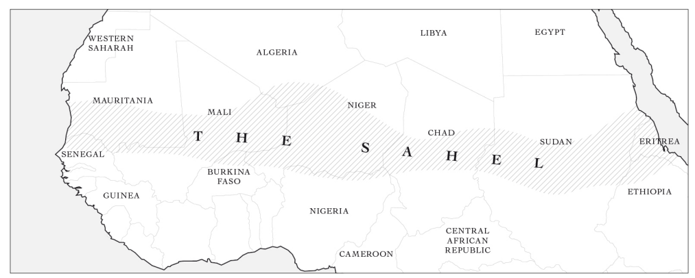
Figure 2: Map of the Sahel

By September 1972 an early warning system, operated by two United Nations agencies, the Food and Agriculture Organization and the World Food Program, indicated that the drought was worsening. Foreign governments and international organizations sent emergency supplies of 55,000 tons of food grains to the Sahelian zone. In spite of these efforts, the crisis deepened in spring of 1973; livestock depleted, vegetation was destroyed and about six million people were in danger of starvation. The World Food Program argued that rain failure during 1973 in North West African was the worst on record and some 30% less rain fell than in 1972. The number of famine deaths during that year alone was estimated to be around 100,000. The human cost of the drought was not only in the destruction of lives but also of their livelihood. Their camels and cattle herd were wiped out; nomads survived the famine only to face despair, disease and a still uncertain food supply in squalid refugee and settlement camps across six countries. Clashes between the refugees from the drought and the population of the settled areas, as well as political and racial tensions between the two in places like Mali,<sup>298</sup> only added to the growing tensions in the region. Life in capital cities like Bamako, Niamey and Ouagadougou became, as one report claimed, a "nightmare."299