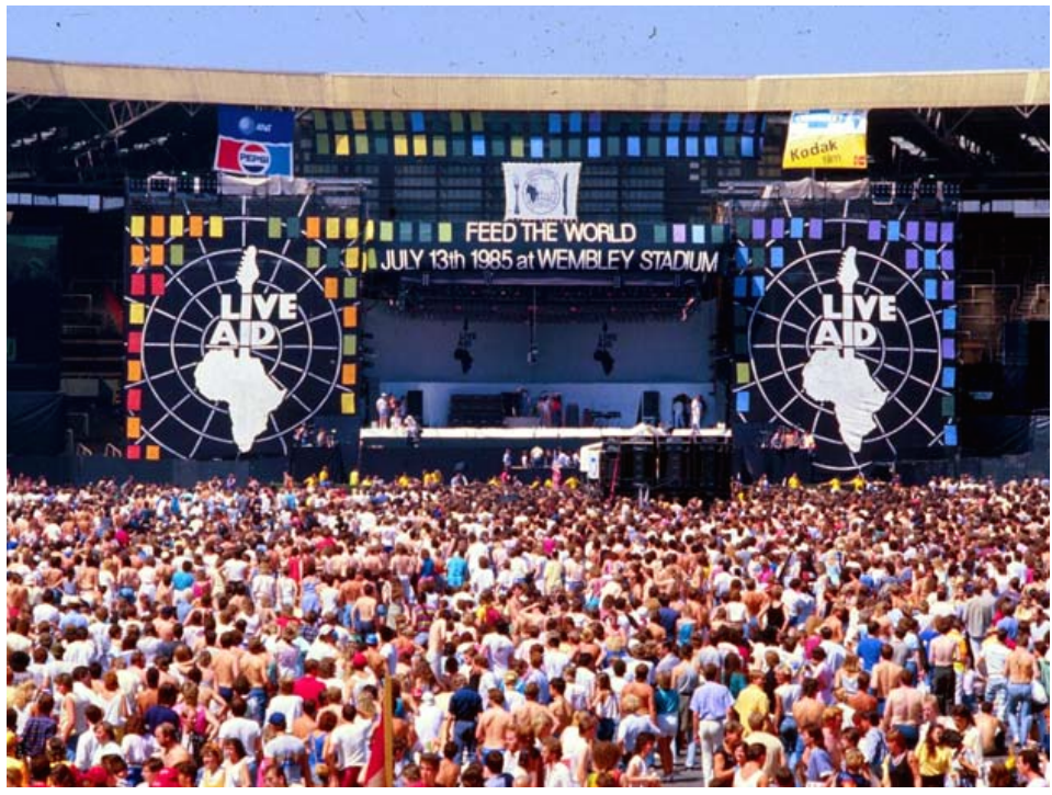
Figure 4. Live Aid stage