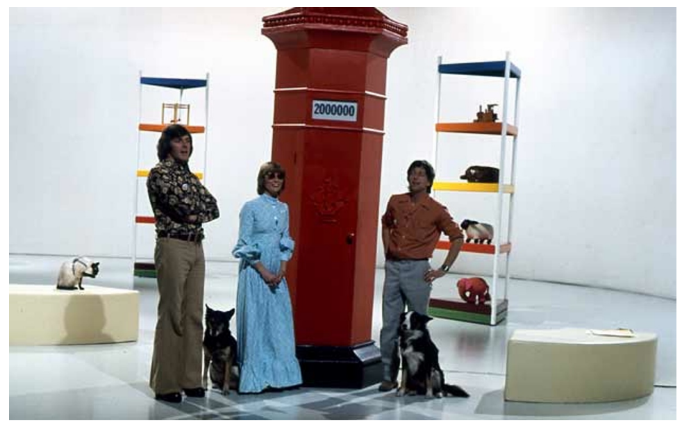
Figure 3. Blue Peter appeal from 1973 targeted to help the drought and famine affecting Ethiopia.<sup>621</sup>

While the Blue Peter team decided on the theme of its appeals and contacted the charity that would administer it, in reality it was also the charity's press office and public relation firm which were highly involved in the campaign. As humanitarian charities began using public relation firms and built their own press offices, their appeals as well as their aid were targeted to specific audiences and commodified.