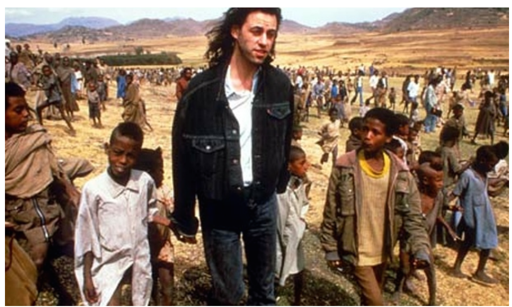
Figure 3. Geldof during his visit to Ethiopia.

Initially, Geldof had planned to disperse the funds through other British charities like Save the Children and Oxfam. But when he realized that these might not go directly to transport food to the Ethiopians he decided to register Band Aid as a charity and donate the money to do just that. In effect he set himself up as more expert than the experts with experience of humanitarian relief in the region. Thus, the money that Band Aid raised had an immediate destination, and an immediate purpose: to buy and transport food. 150 tons of high-energy biscuits were sent, 1335 tons of milk powder, 560 tons of oil, 470 tons of sugar, 1,000 tons of grain. Money was sent to the relief agencies, and lorries and trucks were bought to transport the supplies. The problem with that approach was that the donations were never fully monitored and could potentially be abused by the Ethiopian military or the Tigrian opposition.<sup>686</sup> Nevertheless, after his visit to Ethiopia Geldof decided that these donations were not enough. "There [was] still so much that has to be done,"<sup>687</sup> his charity argued. (Figure 3).