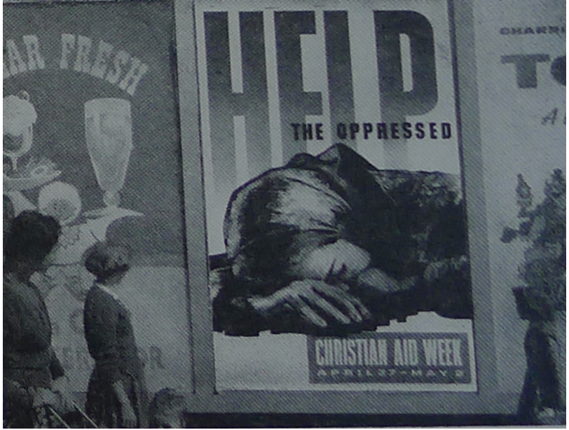
Figure 2. "Helped the Oppressed" a 16-sheet poster as part of Christian Aid Week 1959.<sup>606</sup>

the opportunity "to every citizen to act on [it]."<sup>605</sup> It helped both educate citizens about global suffering as well as to mobilize them to act.