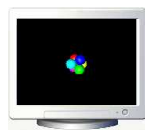
Appendix C: Photo of distraction stimulus