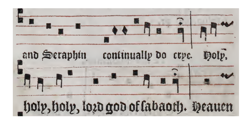
Figure 2: John Merbecke, The Booke of Common Praier Noted , sig. [B]2v. (Courtesy of Boston Public Library/Rare Books; shelfmark Benton 1.3)

Choral polyphony could betray underlying verse divisions of a text through the convention of alternation at a regular interval (by verse or by half-verse): paralleling the more regularized structure of Elizabethan and Jacobean printed books would thus mean forgoing the relatively rapid choral alternation at the threefold "sanctus" that had characterized pre-Reformation practice. Several contemporary compositions do appear to follow this "new" scheme. In the Te Deum settings from the Short services by William Byrd and Orlando Gibbons, for instance, the pace of alternation does not speed up appreciably at "holy, holy, holy." <sup>108</sup>