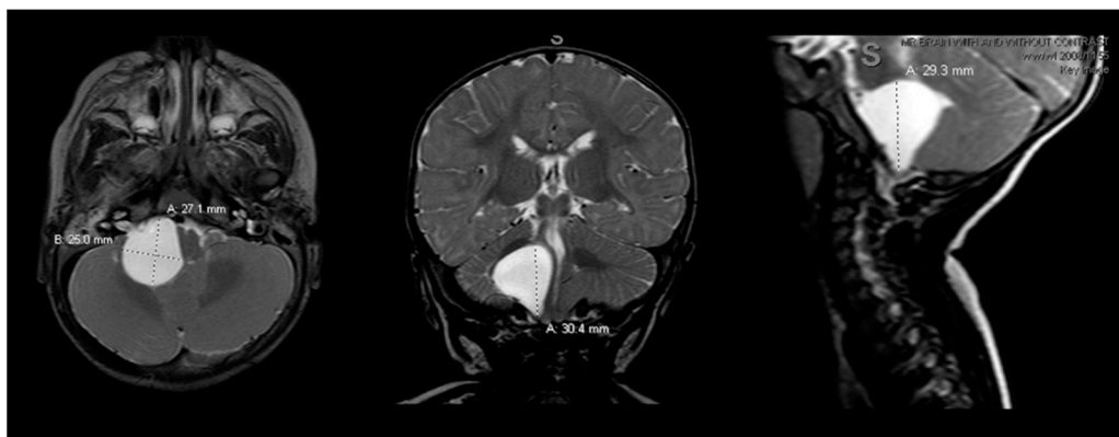
Figure 1. Preoperative brain MRI scan. The preoperative brain MRI scan (left = axial; middle = coronal; right = sagittal) T2 sequences showed a large 2.5 \times 2.7 \times 3.0 cm homogeneous, hyperintense right cerebellopontine angle cystic lesion causing mass effect on the right pons and medulla. T1 sequences (not shown) were hypointense for the cyst, without contrast enhancement on gadolinium scans. MRI = magnetic resonance imaging.

Preoperative magnetic resonance imaging (MRI) of the brain and cervical spine was obtained as the patient's respiratory difficulties and failure to thrive suggested a lesion localizing to the brainstem. MRI showed a large cystic lesion at the right CPA measuring 2.7 \times 2.5 \times 3.0 cm (anteroposterior (AP) \times transverse (TV) \times cephalocaudal (CC), respectively), hypointense on T1 and hyperintense on T2, without gadolinium enhancement, diffusion restriction or susceptibility artifact, most consistent with an arachnoid cyst (Figure 1). The lesion was causing overt flattening of the pons and mass effect along the length of the right superoanterior and lateral medulla, mild mass effect on the right cerebellum, and displacement and mild effacement of the fourth ventricle. There was no abnormal vascularity, syrinx or chiari malformation or extension down to the cervical spine. Ventricles were otherwise normal in morphology and size.