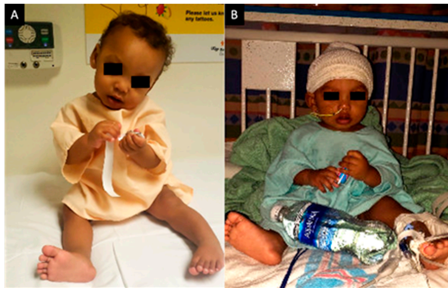
Figure 3. An 8-month-old male infant with torticollis. Panel (A) shows the preoperative patient with asymmetric leftward neck flexion and rotation and rightward chin tilt. Panel (B) shows the postoperative patient on POD 1 with resolution of prior head/neck flexion and chin tilt, as the neck is now midline. POD = postoperative day.