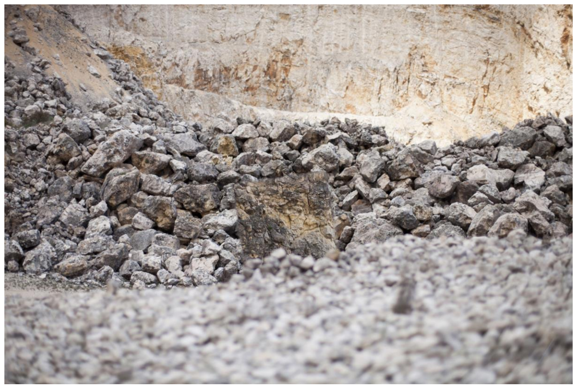
Fig. 5. "Geografía Espejo II," 2017, Victor Hugo Martín Caballero. The European Exhibition of Six Memos , curated by Branka Benčić. Reproduced with permission of the artist.