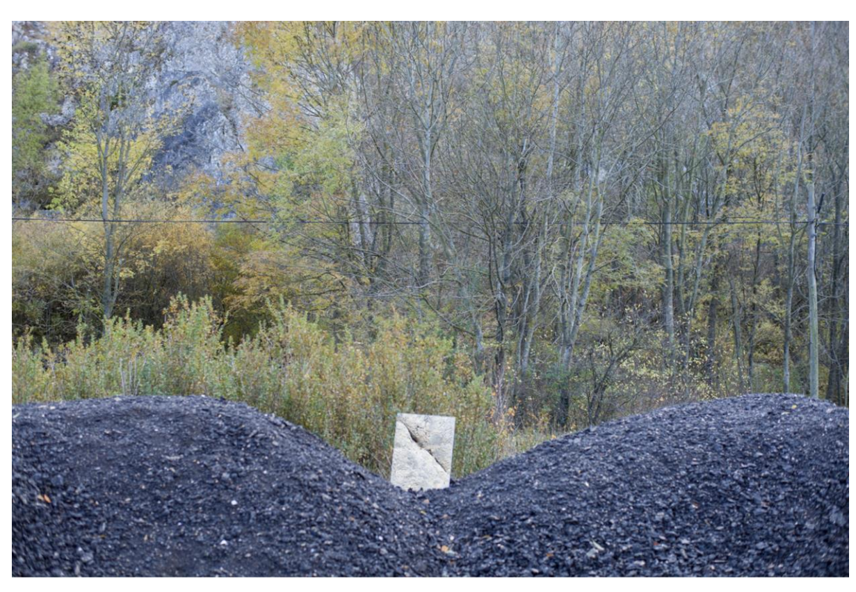
Fig. 6. "Geografía Espejo III," 2017, Victor Hugo Martín Caballero. The European Exhibition of Six Memos , curated by Branka Benčić. Reproduced with permission of the artist.