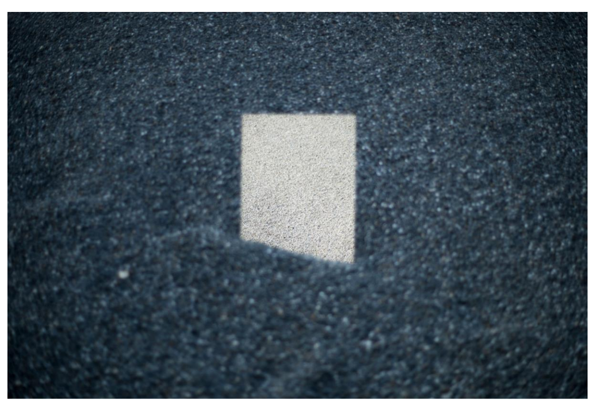
Fig. 4. "Geografía Espejo VIII," 2017, Victor Hugo Martín Caballero. The European Exhibition of Six Memos , curated by Branka Benčić. Reproduced with permission of the artist.