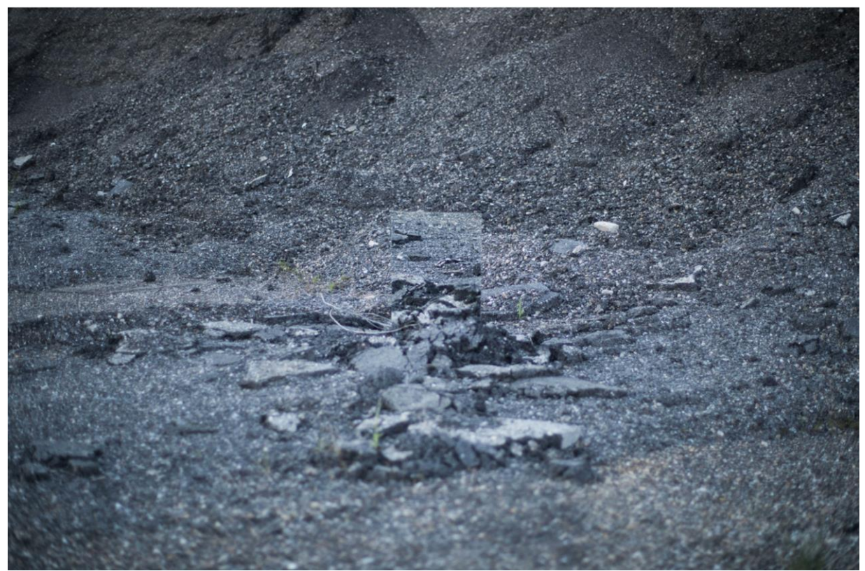
Fig. 3. "Geografía Espejo VII," 2017, Victor Hugo Martín Caballero. The European Exhibition of Six Memos , curated by Branka Benčić. Reproduced with permission of the artist.