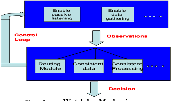
Figure 3. Watchdog Mechanism

This block can be viewed as a collection of discrete modules. Each module carries out a specific function that can range from monitoring communication channel to sensing channel. However, each module also imposes extra resource requirements on the system in terms of energy, storage or processing cost. For example WMRouting monitors the data forwarding behavior of the neighboring nodes by keeping the radio active in the promiscuous mode.