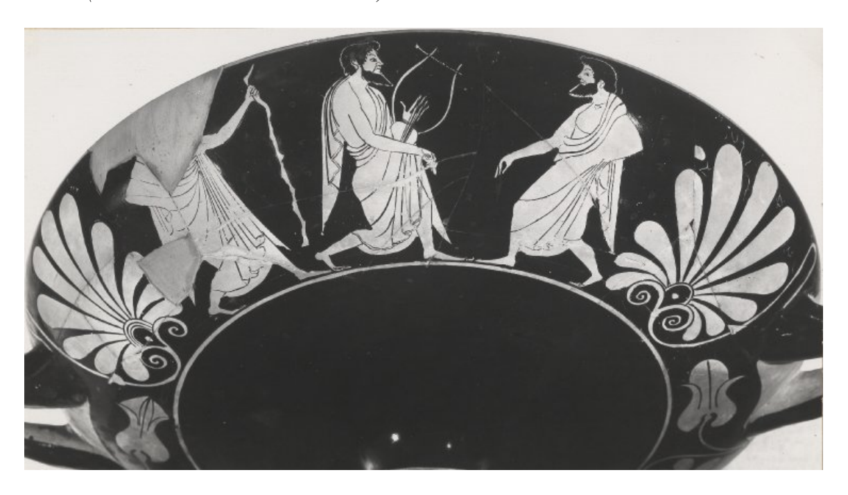
Side B (Nikon, Khilon, and Solon)