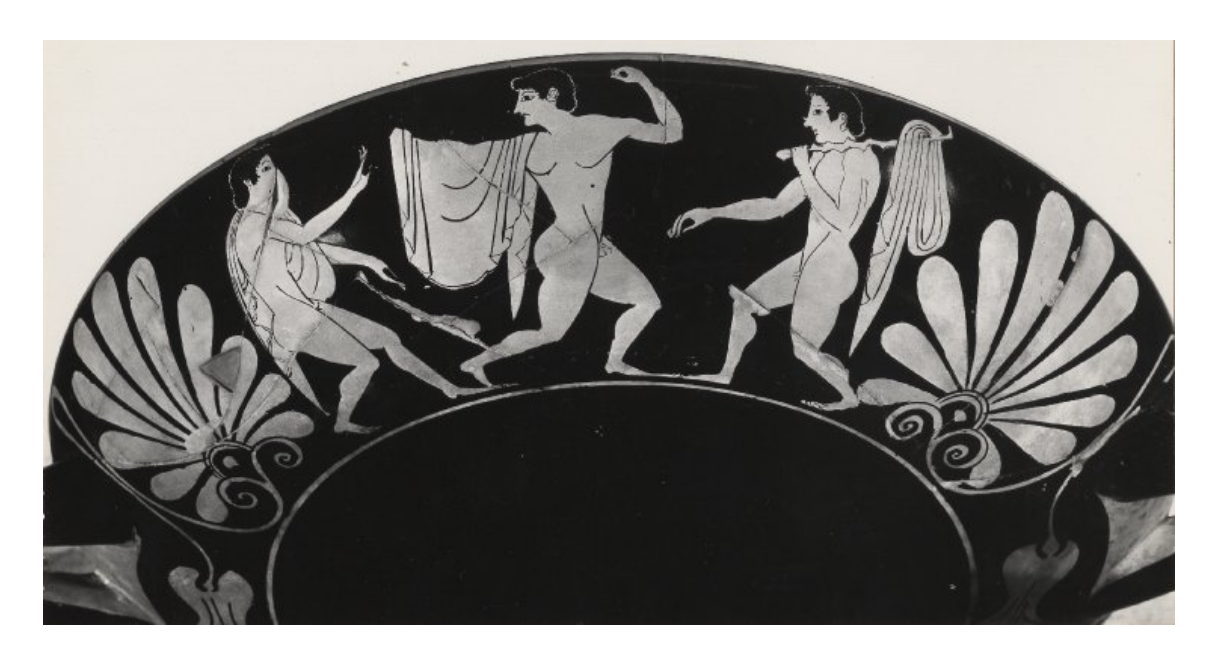
Side A (Molmis, Thallinos, and Xanthos)