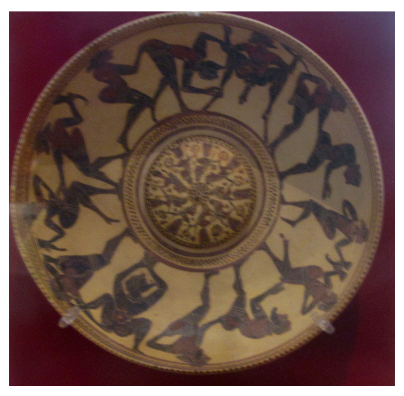
Figure 1: Middle Corinthian phiale, Patras painter, c. 590-570 BCE, © National Archaeological Museum, Athens (536)