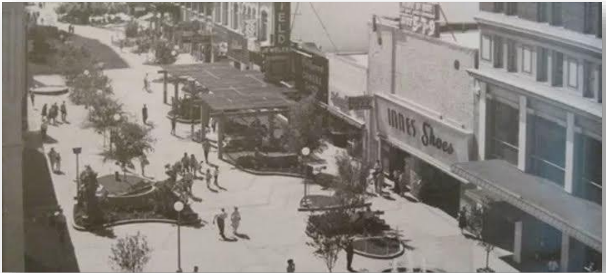
Figure 4: The Mall in 1964