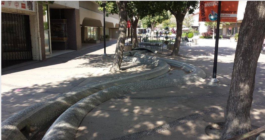
Figure 2.1 The south end of the Fulton Mall (2015)

The redevelopment of the Fulton Mall in Fresno, CA was a small local contest about space, and is important to the master narratives of placemaking. My dissertation investigates these claims ethnographically and sought to capture this particular contestation as historically and culturally-situated. Underneath the site-specific particularism that is the Fulton Mall's revitalization are the larger elements of urbanization and the global political economy of neoliberalism that shapes city landscapes on economic terms. In this dissertation, I highlight how city government crafts policy as it relates to economic markets and city boosterism, not their community's desires, needs or history. Interdisciplinary by design, my scholarship adds to the subfields of political and urban anthropology and the study of urban America's history.