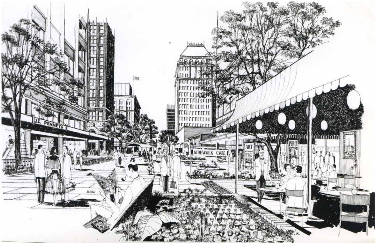
Figure 7: Drawing of the Mall Credit: Victor Gruen and Associates, 1962.