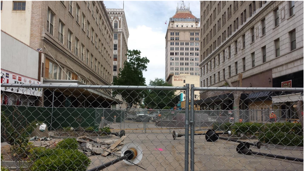
Figure 6: The Fulton Mall amid construction (Photo Credit: Doris Dakin Perez, 2016).

(read: White) and single - who would not be part of the current population who utilized the Mall in its pre-2017 iteration.