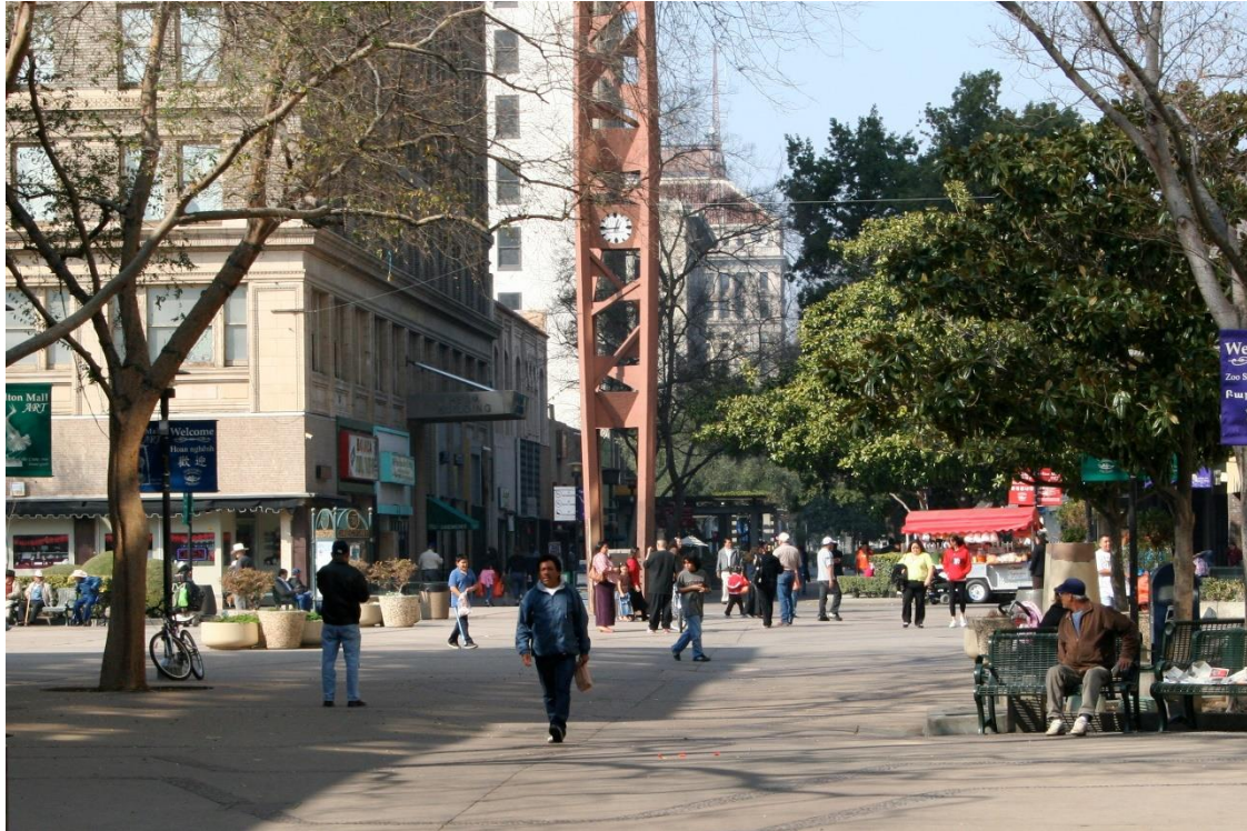
Figure 5: The Fresno Fulton Mall in 2013