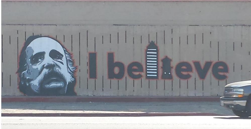
Figure 5.1 William Saroyan's "I believe" Mural