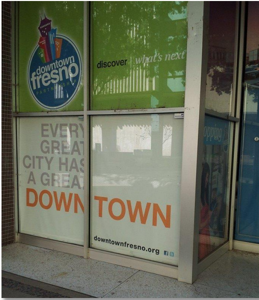
Figure 3: The office of the Downtown Fresno Partnership (2014)

leadership, and finally, how did activist group opposition use history and nostalgia as rhetorical weapons? Here I argue that the political discussion and action engendered by proposed changes to the Fulton Mall are in fact contestation of a burgeoning urban identity first resisted, and then awkwardly embraced, by local leadership in an urbanizing global context.