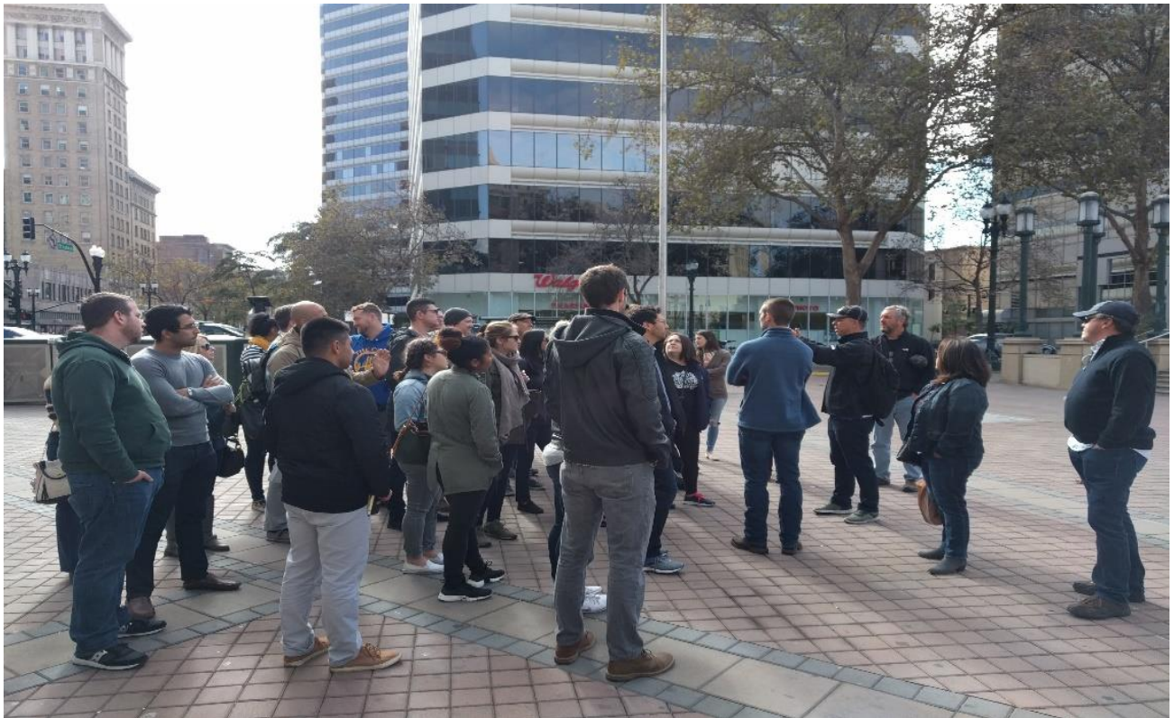
Figure 1: Members of the Downtown Academy on a walking tour of Downtown Oakland, November 5, 2017.

On a rainy November morning, the group of travelers from Fresno arrived in downtown Oakland, or more specifically, the industrial area around Jack London Square’s Amtrak station. An older area that still used most of its four by four block nexus to store and distribute industrial goods and produce destined for Bay Area restaurants, Jack London Square has persisted as a place of disjointed civic investment, first with failing chain restaurants in its open space surrounded by storefronts, now a wildly popular weekly farmer’s market and hipster bocce court even as new high rise condos crowd the skyline above. Other civic institutions abound in this un-place; Jerry Brown, that iconoclast of California politics, is known to have property nearby. As I watched from the back of the group walking along 3rd Street, whose members sleepily dragged rolling suitcases and duffle bags along the sidewalk, boxes of produce were being unloaded from idling trucks into warehouses. We’re not the only ones in fresh from the Valley.