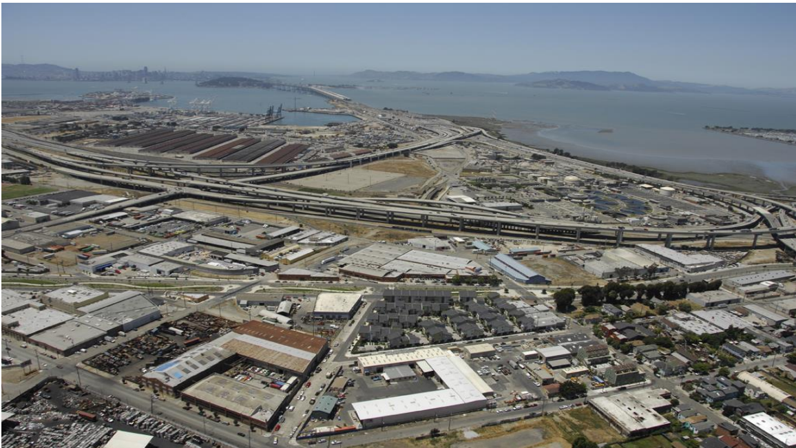
Figure 9: The greenscape of Mandela Parkway, formerly the Cypress Freeway, at center in West Oakland, CA.

place, underutilized, with little market activity like its counterpart Jack London Square to the south. Was the parkway developed to get Oaklanders to Emeryville, the swanky corporate development that lures shoppers to its commercial centers, or was it created to pretty up the vestiges of the collapse of the freeway after 1989's Loma Prieta earthquake? The parkway is now in use, with activity just as varied as its beginnings: hipsters queue up for twelve dollar waffles at Brown Sugar Kitchen, thanks to a nod from O Magazine and The New York Times Style section, and street people collect cans near the intersection of 14th Street and Market. Less than a mile away from Mandela Parkway, the twin spires of Oakland's landscaped United States federal building anchor the bustling downtown business district. Mandela Parkway echoes the underutilized feel of similar civic open spaces in Fresno, empty and designed for a more hopeful era of economic maturity.