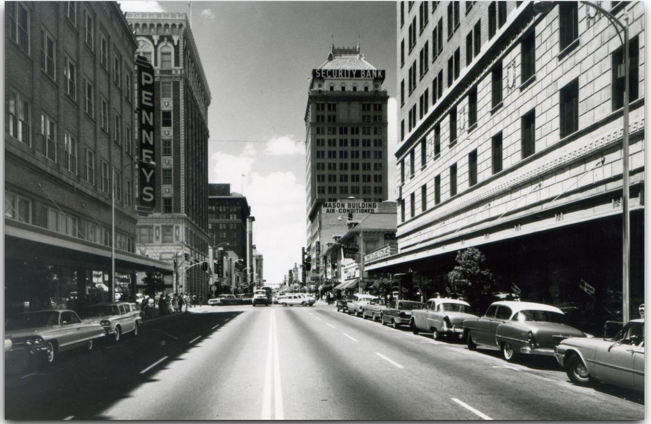
Figure 8: Fulton Street before the Mall

Current urban development debates about the primacy of the pedestrian are also relevant to the revitalization of the Mall. Global planning trends toward a “walkable city”, where density is key to social interaction and cohesion while also serving to counteract public health concerns of cities past. “In a relatively compact, mixed-use neighborhood, shopping is not just consumption. Rather, shopping helps foster social interaction between neighbors. . . a shared sense of community might arise... enriched with a variety of meanings.” 30 The current urban planning emphasis on an ideation of place so different from the car culture that is inherent to 20th century California, from which Fresno takes its cues, is profound. This type of futurism is reiterated by Benedict Anderson, who wrote that “[national] communities are to be distinguished, not by their falsity/genuineness, but by the style in which they are imagined” (Anderson 1982, 6). The visions of economic prosperity, commercial investment, and the nearly $313 million economic output envisioned by the urban planners contracted by the City of Fresno leave the de facto use of the Fulton Mall as a parkland and public meeting area out of the realm of possibility. The public use of private land on the Mall, now lightly policed due to small crowds, would change as more restrictions would be placed on activity. Setha Low writes that William H. Whyte, influential urban planner of New York City, saw the decline of