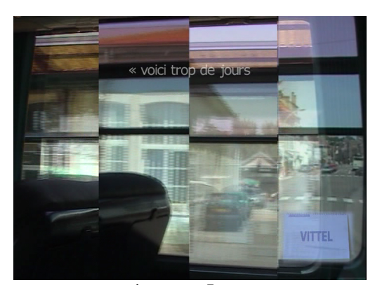
Figure 7. Intime.

In addition to subverting the indexical integrity of the image frame, this editing technique also draws attention to the treacherousness of the digital image with its "ease of manipulation" and inability to guarantee the spatiotemporal unity of the forms it captures. Because this technique amounts to stitching together specific portions of four different frames, it brings with it the possibility of juxtaposing footage from non-contiguous points along the train's path, footage taken on different occasions along that same train line, or indeed footage from merely resemblant locations—close enough to "pass" as part of the same landscape when viewed at full speed.