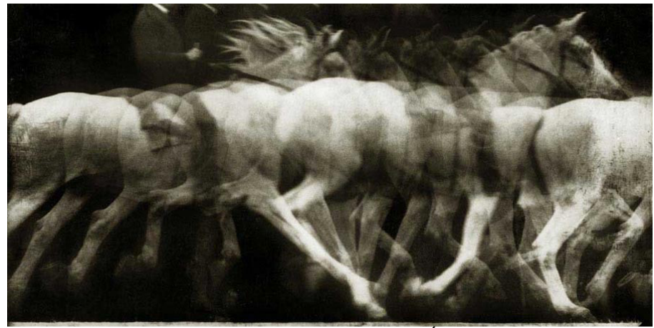
Figure 8. Cheval blanc monté au galop (1886). Étienne-Jules Marey.