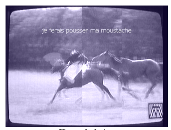
Figure 9. Intime.

The reference to Marey is redoubled in Alferi's editing of the footage. The successive exposures of the photographic plate in the above chronophotograph destroy the spatiotemporal unity of the frame by representing multiple captures of one animal's movement within a single space. Alferi creates a similar effect in this sequence by splitting his frame down the middle, then splitting it again, to juxtapose two (then three, then four) playbacks of the same footage set off one from the next. As he sews the successive positions of the horses' bodies into novel combinations, Alferi seems to be chasing a particular convergence in which all four of a horse's legs are simultaneously aloft and outstretched. The body position just described, and that we can see achieved here in Figure 8, was one that many in the late nineteenth century assumed to be achieved by horses at a galop (as it is when they execute jumps). Marey's locomotion studies—and those of his better-known contemporary Eadweard Muybridge—famously showed that when all of a horse's hooves are aloft at a gallop they are tucked under the body, not outstretched, as some assumed. In Intime , Alferi is able to falsify the claims of these proto-cinematic motion studies through the use of digital editing tools that have no equivalent in either celluloid or video formats. He cuts into