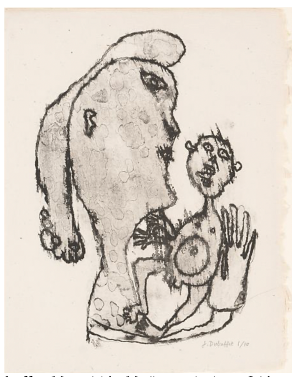
Figure 2. Jean Dubuffet, Maternité, in Matière et mémoire, ou Lithographes à l'école, 1945.