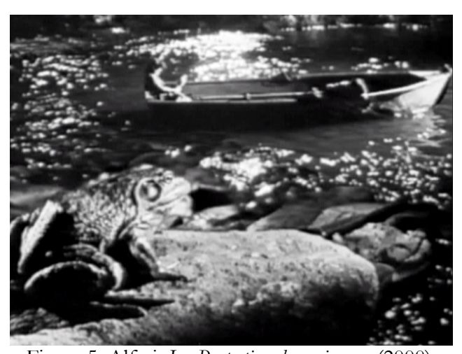
Figure 5. Alferi, La Protection des animaux (2000).

<sup>262</sup> Éric Trudel refers to Alferi's reappropriation of film images in these works as "highjackings," the forceful commandeering of an old film, turning it towards his own purposes. I might characterize them rather as "joyrides" given the gleefulness with which Alferi explores the editing tools newly available to him. See Trudel, "Poems and Monsters," 44.