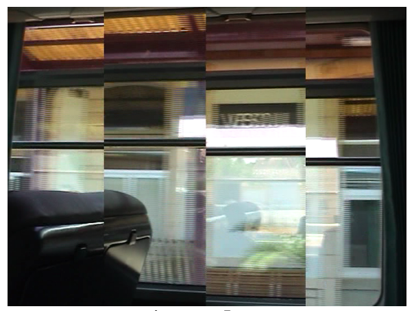
Figure 6. Intime.

The outside world flashes by rapidly, right to left, as the train travels express, bypassing the Vesoul train station whose sign we can barely make out. Alferi splits his moving image into vertical panels each of which is set deliberately out of sync with the others. At their normal playback speed, these images move quickly enough to conceal the logic of their montage , but not so quickly that the viewer gives up groping for that understanding. Our eyes flit back and forth, trying to track the left-bound movement of details across the panels, but these efforts rarely bear fruit. This study of the images' composition is frustrated further by the arrival of text, which must be read left-to-right, against the current of the passing façades. The editing techniques that Alferi applies to his images here, as well as the carefully timed titles delivering a sparse text, suggest an experimental project which hooks into several of the preoccupations that readers of his poetry will recognize as central to that work: the unfolding of images and meanings in time, the principle of montage as it relates to poetic enjambment, the temporalities of viewing and reading, the animation of text that here becomes literal.