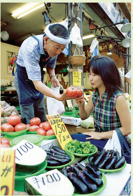
Global consumption of fruits and vegetables is on the rise, but important markets for California produce growers such as Europe and Japan, above , have taken a cautious approach toward imports of transgenic foods.

Integration among international traders and grower-shippers allows them to position themselves as consis-