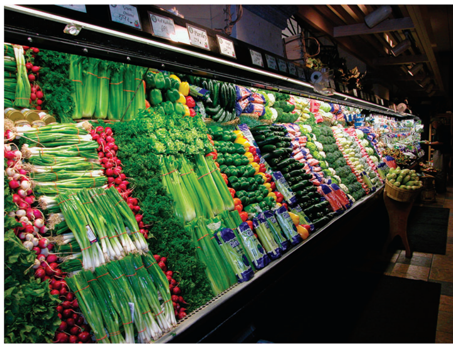
While agricultural biotechnology has revolutionized agronomic crops such as soybeans, corn and cotton in the United States, thus far virtually none of the produce on supermarket shelves is genetically engineered. The reasons for this disparity are complex.

What will happen in biotechnology applied to horticultural crops is up to the government, for a variety of economic reasons. Some of these aspects may be unique to GM horticultural crops but many are common to GM crops generally, and similar issues arise with some new non-GM technologies.