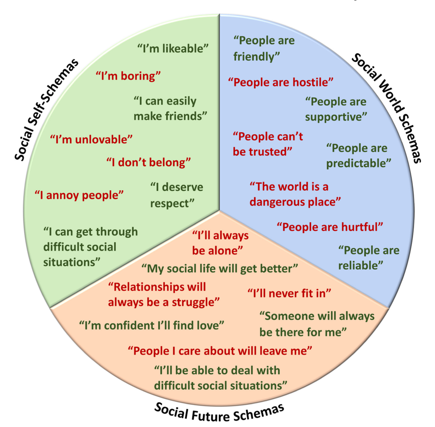
Figure 2. Examples of socially safe and socially threatening beliefs, organized by the three main types of social safety schemas.