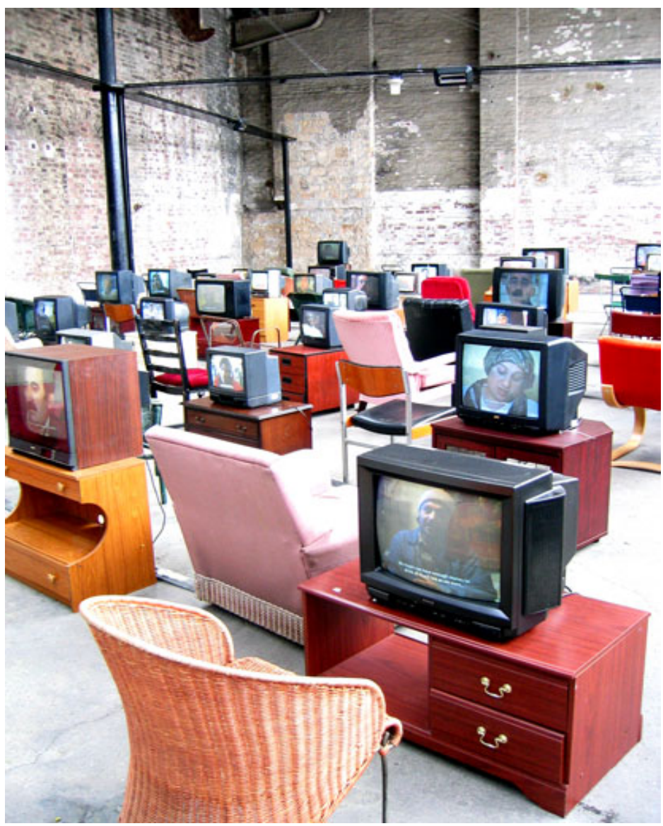
Figure 11 Küba, installation view

foregrounds site as a "process, an operation occurring between sites, a mapping of institutional and textual filiations and the bodies that move between them (the artist above all)" (25). Functional site, with its temporal existence, operates through "a chain of meanings and imbricated histories: a place marked and swiftly abandoned" (25). In this framework, site-specific video installations are especially evocative in that as experiential sculptures they stage temporal and spatialized encounters between viewing subjects, sites, and screens.