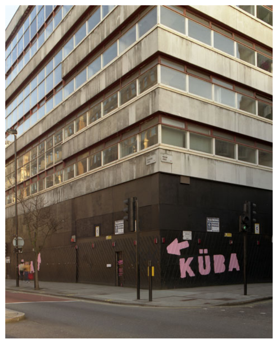
Figure 8 Sorting Office, London

compartment in which the movement of other passing trains on nearby tracks was highly felt. Indeed, the installation invited not only art audiences who enter the station to see the work but also travelers and other people who use the space for various purposes. In the Stuttgart exhibition, in particular, the installation underscored the ways in which migrant experiences are conditioned by travel networks, infrastructures, and transport technologies, and produced a palimpsestic spatiotemporality marked by various migratory routes. Hence, it encouraged the viewers to question the issues of class and social mobility indicated by the forms of travel embedded in the site.