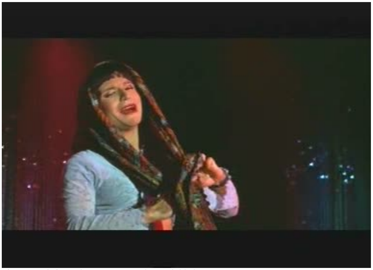
Figure 1 Lola in Kutluğ Ataman's Lola + Bilidikid

Location and Mobility in The Site-specific Video Installation Küba (2004)