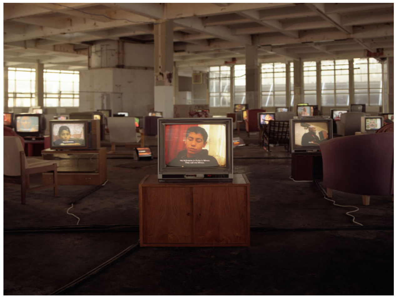
Figure 3 Küba, installation view, London