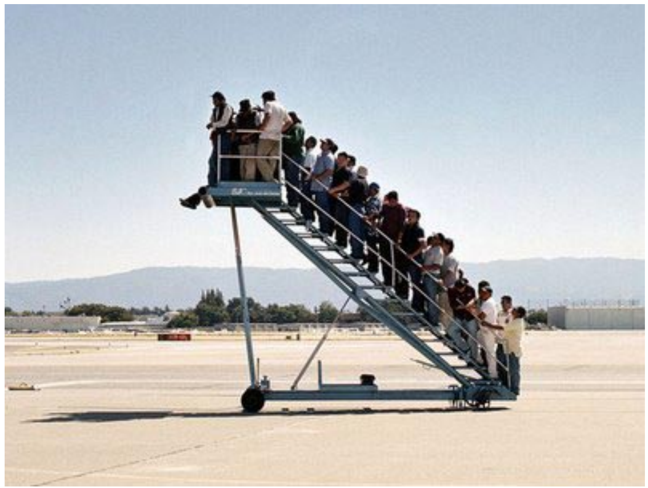
Figure 1 Adrian Paci Center for Temporary Stay and Assistance (2007)

Centro di permanenza temporanea (Center for Temporary Stay and Assistance),<sup>1</sup> a single-channel video installation produced in 2007 by Milan-based Albanian artist Adrian Paci,<sup>2</sup> opens with a wide-angle long shot of an airport runway. A static camera frames a mobile stairway, which seems to be attached to a plane that has been left out of the frame. Cut to another static shot in which the camera is located at the top of the stairs, looking down on the concrete runway. Ten seconds later, a group of people walking in a line enter the frame and begin climbing the stairs toward the camera. Cut to their feet, which reluctantly move forward, filmed