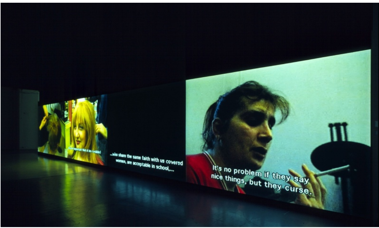
Figure 5 Women Who Wear Wigs/ WWWW, installation view