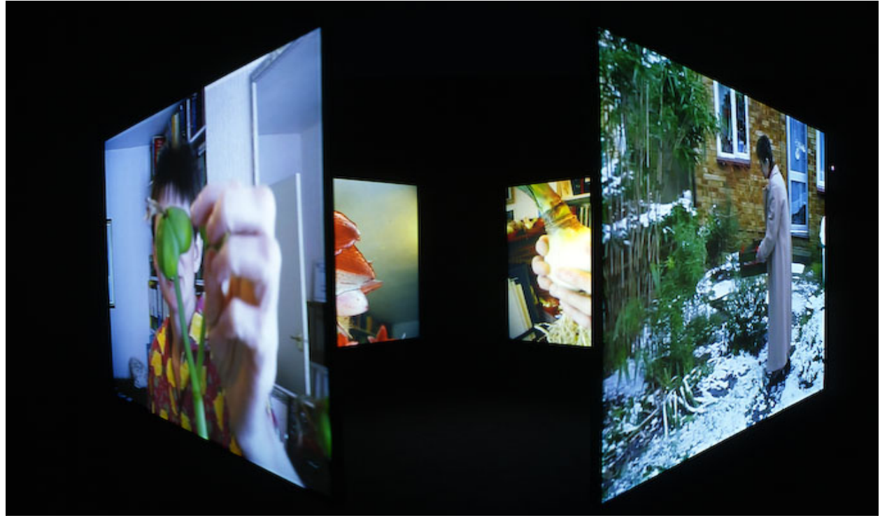
Figure 6 The 4 Seasons of Veronica Read, installation view