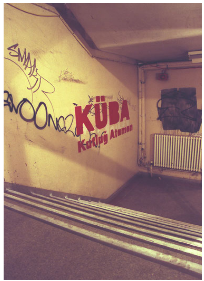
Figure 9 Sorting Office, London

site; "the circuitous journey echoe[d] the journey to the obscure, out-of-the-way, Istanbul slum that is Küba" (Lebow 61). As film scholar Randall Halle points out, each installation of Küba "took on a different quality, mirroring differently various aspects of ghettoization/community building" (47).