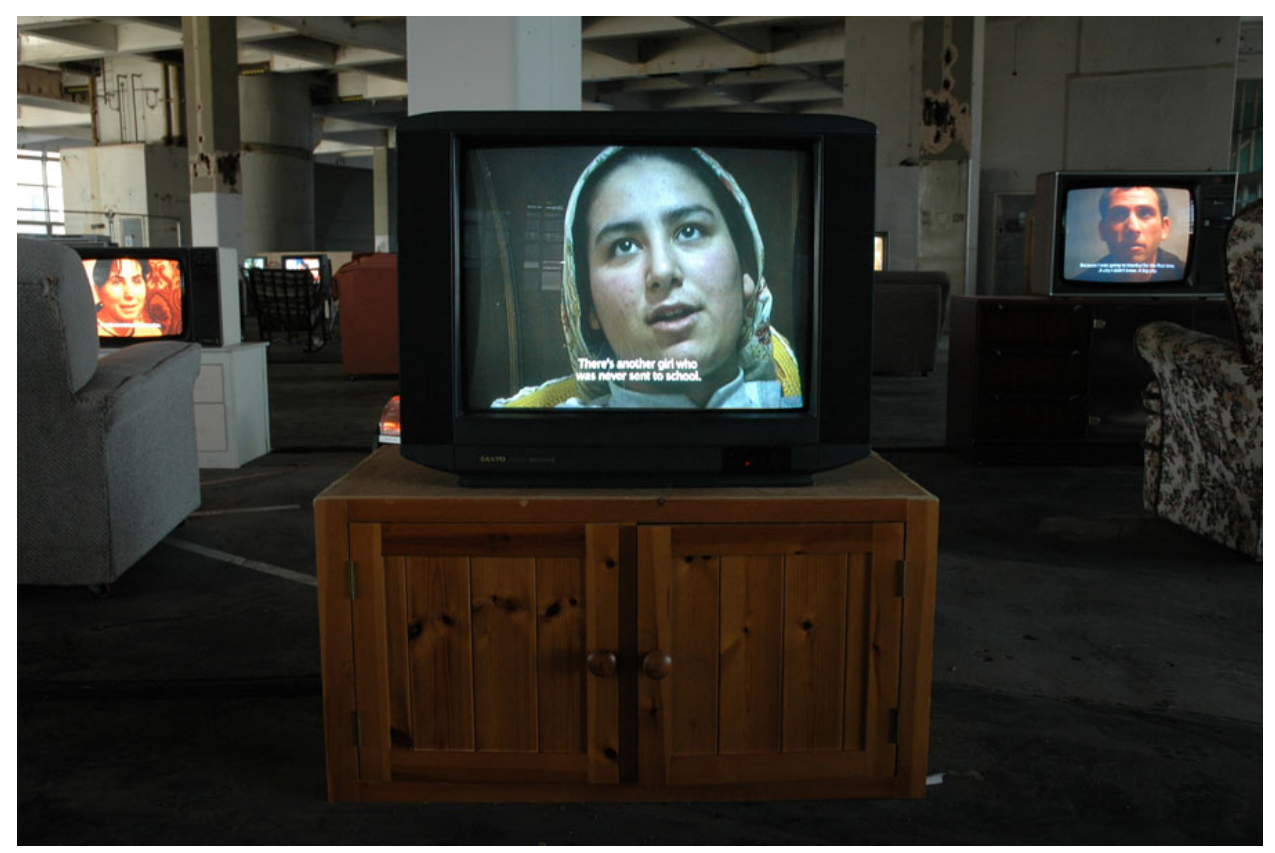
Figure 12 Küba, installation view, London

images and the viewing experience" (326). As Fowler suggests, the migration of moving images from theaters to galleries has produced new forms of spectatorship that alter the viewing experience and meaning of images by allowing the viewer to "perambulate, choose when to enter or exit, where to stand, sit or walk, and even (with multi-screen work) where to look" (329). To take these arguments a step further, I suggest that an engagement with the specificity (historical, cultural, geographical, or architectural) of the site of display and how it informs the viewer's experience of images is crucial in understanding embodied spectatorship in context rather than framing it through an abstract notion of spectating or site. The installation K \ddot{u} b a is able to evoke specificity of time and space through its geographical, social, and personal context as well as through "[its] architectural space, organizing the spectator's access to mobility and stillness" (Cowie 124). The sites temporarily occupied by K \ddot{u} b a become its constitutive parts with their architectural and sociohistorical specificity, conjuring up unique forms of engagement with the work (see fig. 11, 12).<sup>93</sup>