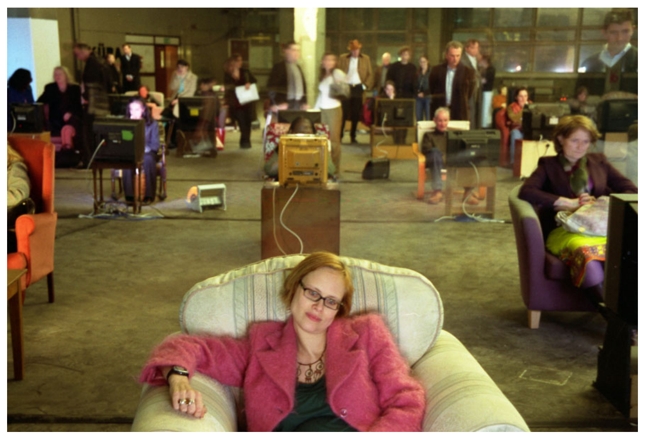
Figure 10 Küba, installation view, London

proper location" (183). While remaining integrally linked to its place of "origin," the shantytown, Ataman's Küba has undergone a process of reconstruction in each installation, persistently rearticulating the relationship between moving images and the site of their display. Indeed each installation of Küba has taken into account new factors encountered in each site such as architecture, geography, and the various histories attached to a particular site.<sup>89</sup>