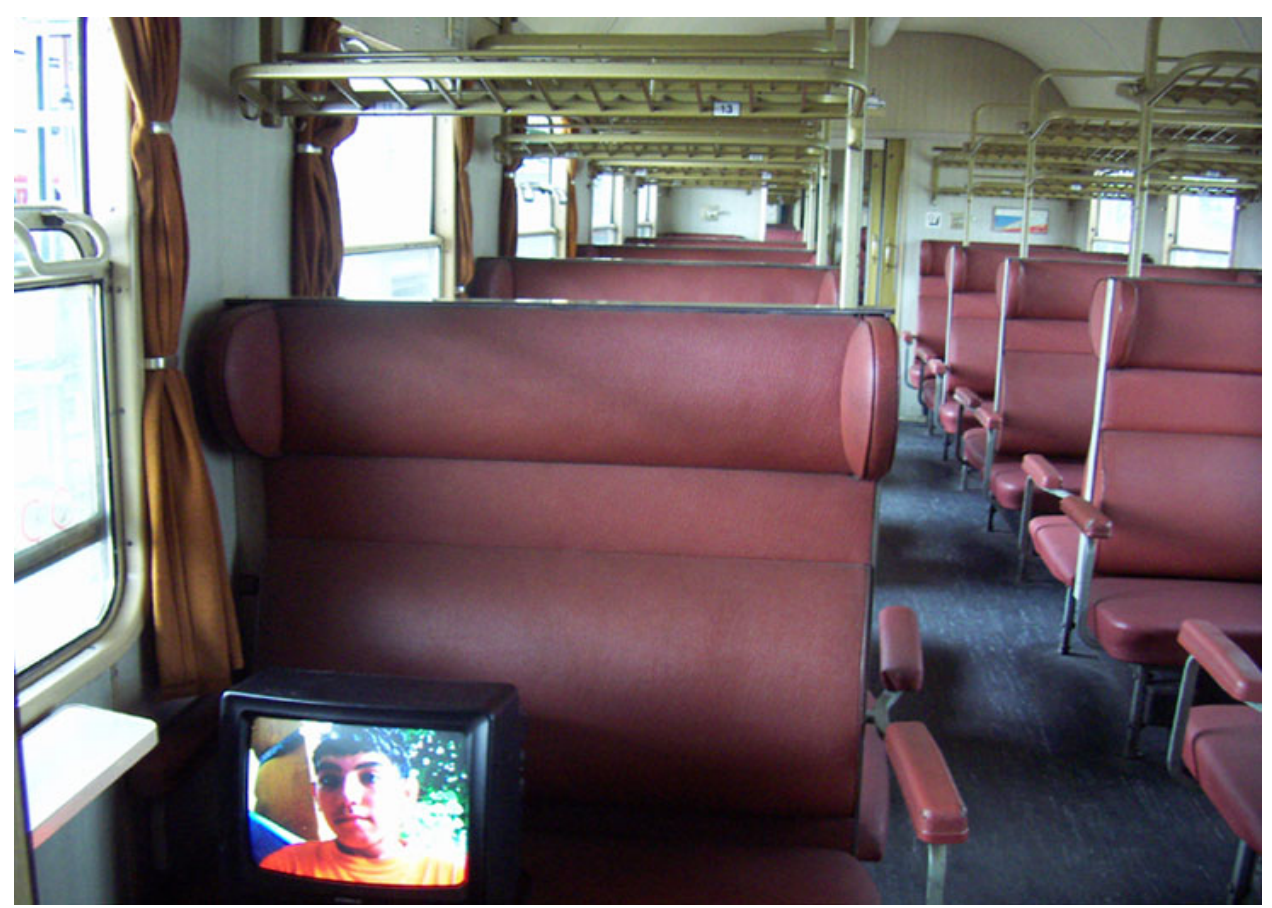
Figure 7 Küba, installation view, Stuttgart