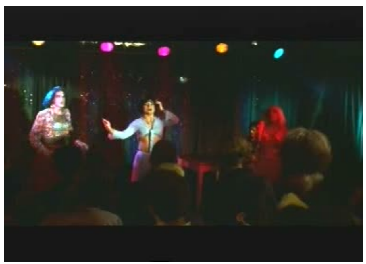
Figure 2 The performance group Die Gastarbeiterinnen in Lola + Bilidikid

German subjects in cinema, Lola and Billy the Kid foregrounds the sexual and ethnic diversity of migrants in Germany as well as the multiplicity of the experience of migrancy.<sup>82</sup> Thus the film transgresses essentialist identity politics that assign fixed roles to migrants and natives.