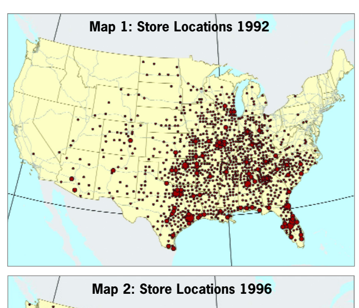
Figure 1. Wal-Mart store locations 1992, 1996 and 2000