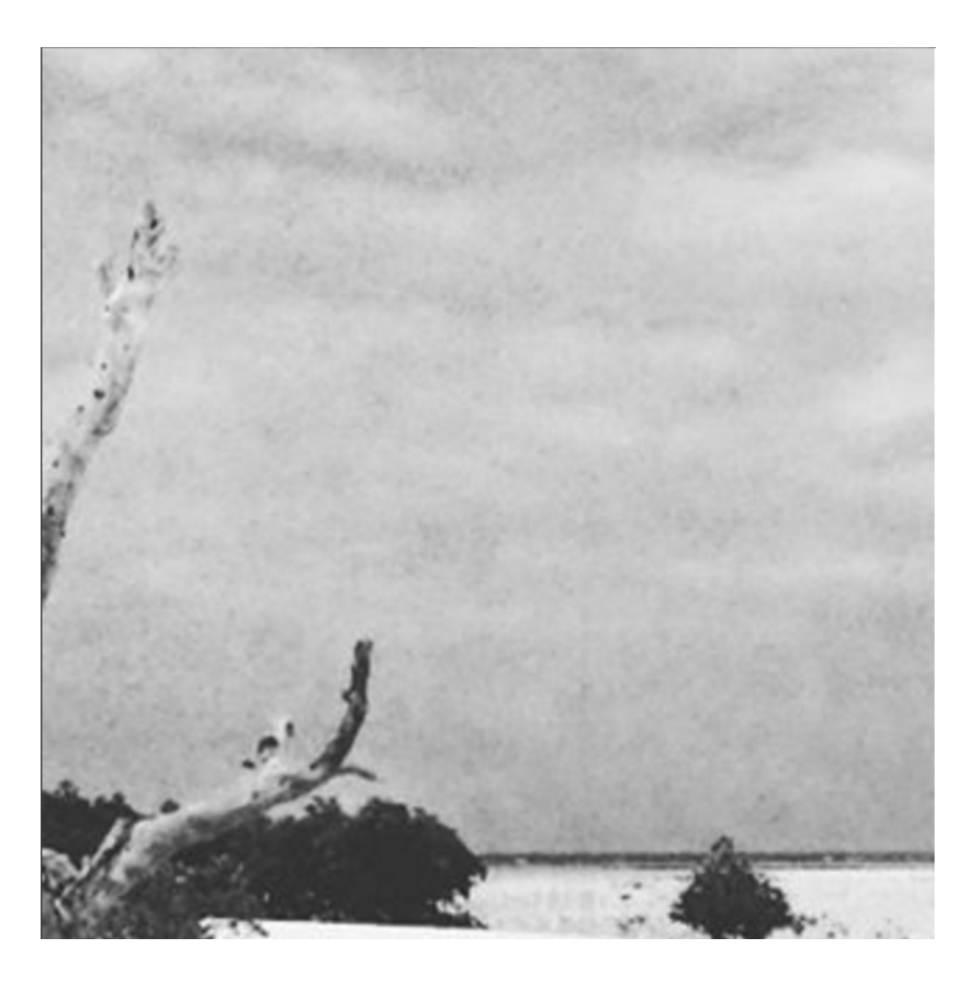
Figure 6: Instagram image of an abandoned beach by Zaskia Gotik.

The abandoned beach, sand decorated with driftwood, stands in stark contrast to her usual posts, mainly of herself in formal dresses is dressing rooms, airplanes, and on stages. Gone is her body, her clothing, and the settings that so often framed them; yet the impulse remained to take this most private moment and use media technologies to broadcast it. Why did she post it? Was it a symbol of malu ? Of sadness? Of escape? Abandonment? Whatever the reason, this image's symbolic disconnection demonstrates on one hand the power of images of infrastructure as a framing narrative. Its lack here shows humility, melancholy, escape, a drastic change from Gotik's usual presentation of identity. However, even in the midst of a scandal, Gotik trusts media infrastructure,