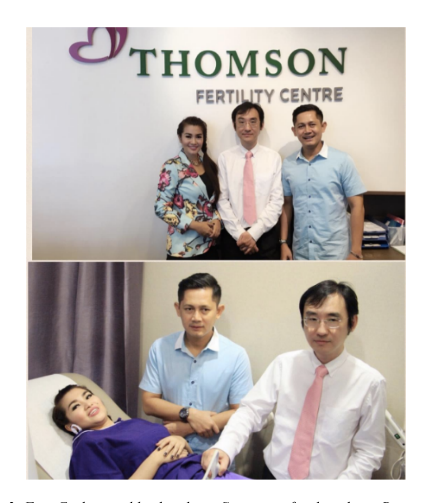
Figure 3: Fitri Carlina and husband at a Singapore fertility clinic.

On January 15th, 2016, Fitri Carlina instagrams a promotional post for her latest single and music video, titled "Jimmy." Dressed in tight black leather, she stares defiantly at the camera, flanked on either side by backup dancers dressed likewise in skimpy, edgy black clothing. She stands in a studio designed to evoke urban space through its brick walls and concrete floor. Her persona is sophisticated, sensual, that of a dangdut star who can command a stage and a crowd of fans.