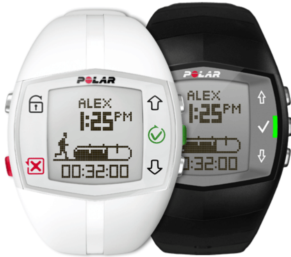
Figure 1. Polar Active accelerometer watches used for 24/7 activity measurement for 134 children enrolled in Niños Sanos, Familia Sana (Healthy Children, Healthy Family), Central Valley, California, 2012–2013.

The Polar Active has user feedback features on its face. These features include an activity bar that represents the user's time in MVPA and an animated figure indicating the user's current activity intensity. Such features may engage users in their activity levels and skew normal behavior; in research studies participants should be blinded to the measured variable to prevent bias. To address this issue, researchers followed a protocol of instructing children to go about their normal activities and did not explain the meaning of the accelerometer watch features. Accelerometer watch settings were locked before distribution so that children could not access data stored in the device. During the months of April through August 2012, children enrolled in NSFS aged 4–7 years were asked to use the watch-like device for 9 consecutive days, allowing for the collection of up to 7 complete days of data. Our CBPR approach (9) used a combination of collaborative strategies between research and field staff, school staff, and health promoters to distribute devices to individual children during community events, health fairs, home visits, and field office appointments. At distribution, children and their parents were verbally instructed not to remove the waterproof device during the period of