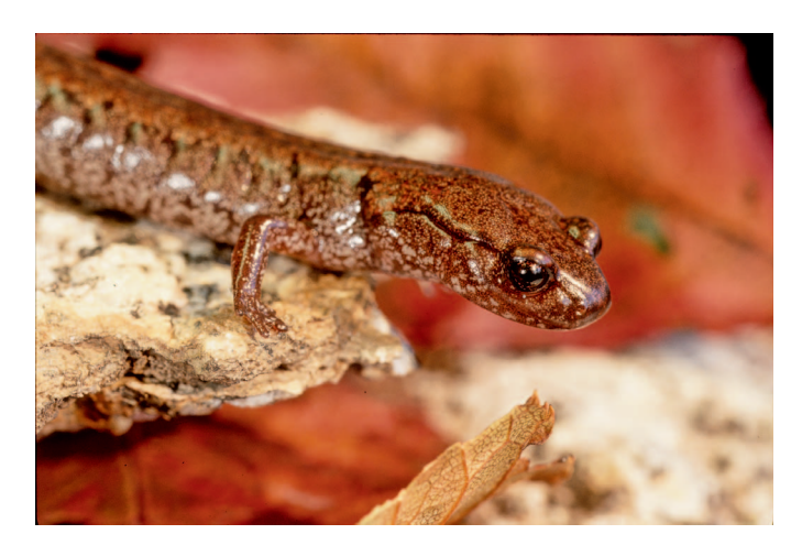
FIG. 2.—Adult female paratype (MVZ 246033) of Karsenia koreana , photographed by R.M. Brown in October 2004 and published with his permission.

connections that have existed between eastern Eurasia and western North America (Beringia), long considered to be the dispersal route of plethodontids to Europe. This discovery only heightened my interest in that route. We know that Earth was profoundly affected by events at the end of the Cretaceous, and when the rapid diversification of the present-day Plethodontinae took place in early Tertiary times, an extended period of global warming likely had left ancestral forms far to the North where distances to Eurasia, especially eastern Eurasia, would be relatively much shorter than potential dispersal routes in the late Pleistocene and Holocene. I think it was at this time that ancestors of both Karsenia and Hydromantes reached the Eurasian continent. I can only hypothesize that expansion followed by massive and probably long-continued extinctions left the current Eurasian species in fortunately favorable habitats, basically as relics of past distributions.