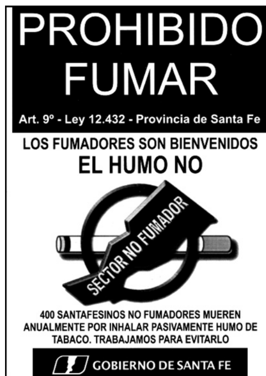
Figure 1 No smoking sign.