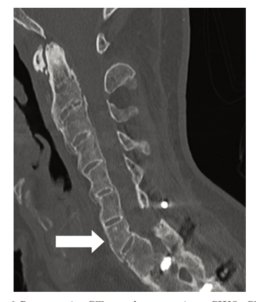
Figure 3 Postoperative CT scan demonstrating a CWO. CT scan shows a C7 CWO 12 months after surgery with solid fusion and no anterior column gap or translation across the osteotomy site. CT, computed tomography; CWO, closing wedge osteotomy.