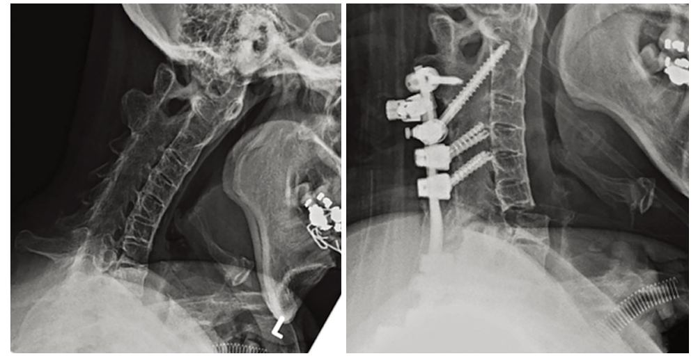
Figure 2 Preoperative and postoperative X-rays demonstrating an OWO. Preoperative X-ray demonstrates cervical kyphosis related to ankylosing spondylitis. Postoperative X-ray demonstrates an OWO across C6–C7 with correction of the kyphotic deformity and restoration of cervical lordosis. OWO, opening wedge osteotomy.