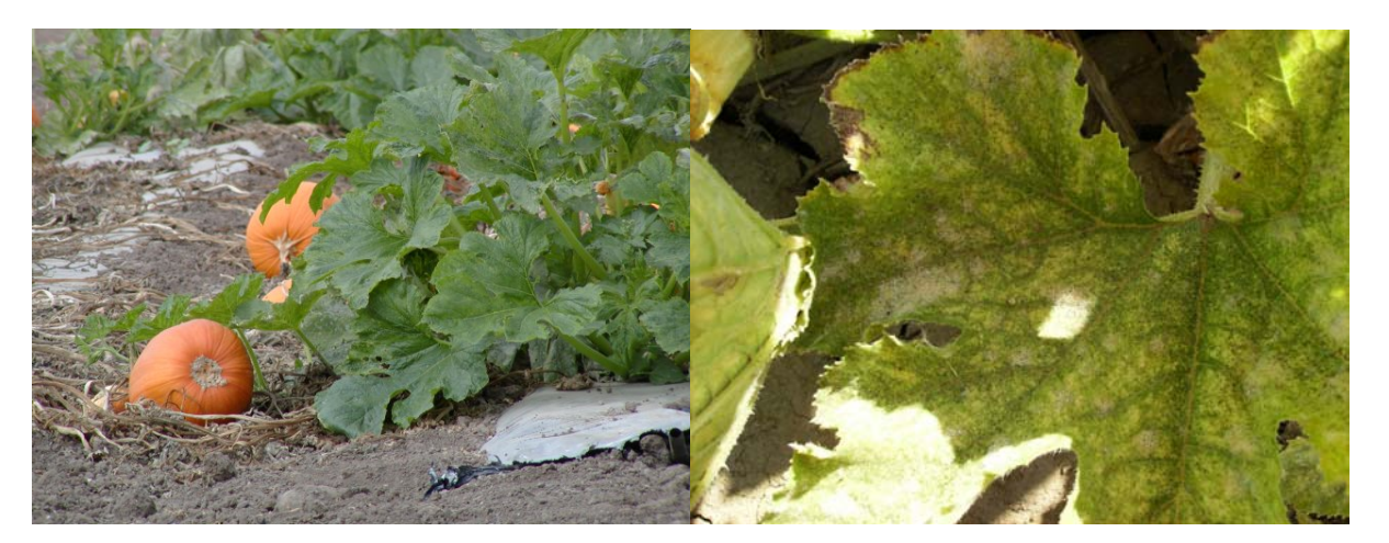
Figure 1. a) Pumpkins in field at maturity and b) Pumpkin leaf showing powdery mildew.

We conducted two field trials at the UC Davis plant pathology experimental farm in Solano County, California to evaluate the effectiveness of 'soft-chemistry' and synthetic fungicides in managing powdery mildew on pumpkins and zucchini ( Cucurbita pepo ) using the susceptible cultivars Sorcerer and Elite, respectively. We applied fungicides every 7 to 14 days for a six week period beginning Sept 2 and continuing through Oct 13. Following four or seven applications, depending on treatment, we assessed disease incidence and powdery mildew colony density on the upper and lower surfaces of leaves in each treatment.