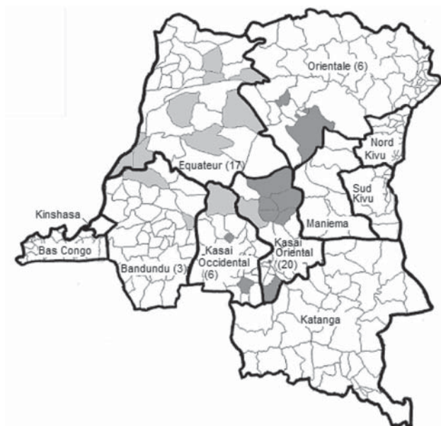
Figure 1. Distribution of 52 confirmed cases of human monkeypox (MPX) by health zone in the Democratic Republic of Congo (DRC), 2001–2004. The cumulative number of cases per province is in parentheses. Confirmed cases of MPX originated from a total of 26 different health zones located in 5 provinces of DRC; most (70.5%) were reported from Kasai Oriental and Equateur Provinces. Two groups can be differentiated on the basis of sequence of the hemagglutinin gene: light gray, group 1; dark gray, group 2. Note: The boundaries of the DRC health zones have since been redrawn. Although the health zones Tshopo and Mweka are not shown (located in provinces Orientale and Kasai Occidental, respectively), the general area is highlighted to represent MPX cases in these regions.

infection in humans because it causes disease clinically indistinguishable from smallpox. Recent outbreaks of MPX in the United States (13), the Republic of Congo (14) and Sudan (15) highlight the capacity of this virus to appear where it has never before been reported. Because clinically, MPX is often confused with chickenpox, laboratory diagnosis is critical to determine whether a suspected case is indeed MPX. In our study, we identified the causative agent for a rash-causing illness in 83% of all patients. We have recently strengthened the MPX surveillance program to improve understanding of the epidemiology of human MPX.