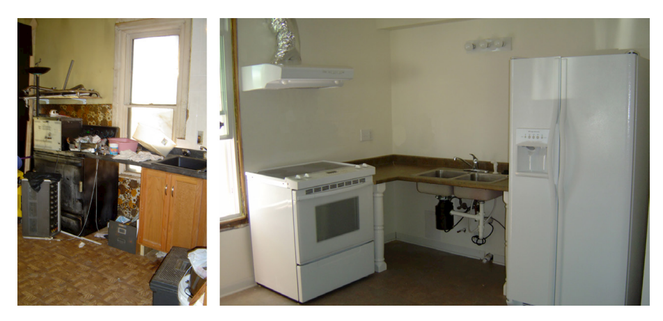
Figure 4. A kitchen renovation done by Rebuilding Together Twin Cities.

other, reporting to each other and sometimes the police if they see suspicious activities. Two of the homeowners we assisted in North Minneapolis live right next to each other. One of the homeowners is in her late eighties and worked as a schoolteacher in the community for many years. She knows almost all of her neighbors, and is a watchful eye in the neighborhood. She looks out for her neighbors, and calls the police if needed. Her next-door neighbor, who is considerably younger, calls to check on her several times every day, and just to chat. Parents often send children in the neighborhood to stay after school with these neighbors, who are trusted members of the community, until they come home from work. Both neighbors suffer from health problems, and the work done by Rebuilding Together has helped make their homes safer, so that they may stay in them longer, and continue to contribute to the social stability of the neighborhood.