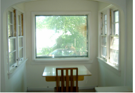
Figure 3. Repairs done by Rebuilding Together Twin Cities to create a workspace in the home of a low-income Minneapolis resident.