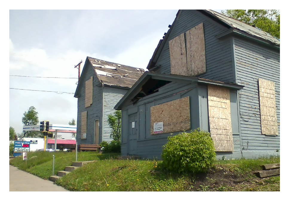
Figure 1. Condemned homes in North Minneapolis marked for demolition.

American Dream of homeownership can also make low-income homeowners vulnerable to a host of complications. Cultural norms teach us that we should be able to maintain the space we own, but problems like predatory lending schemes or impossibly high repair costs can create shame and low self-esteem for these homeowners. In the fallout of the housing crisis, many made the argument that the notion of homeownership was to be questioned and that lower-income or financially illiterate homeowners were partly to blame for the high numbers of foreclosures. The contradiction here lies between homeownership as cultural icon symbolizing much-needed stability for vulnerable communities and the potentially devastating financial burden of predatory lending and contracting that can impede or even prevent upward mobility.