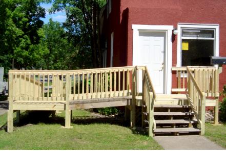
Figure 5. Accessibility ramp and exterior repairs for this low-income homeowner helped to make the home safer and more personal.