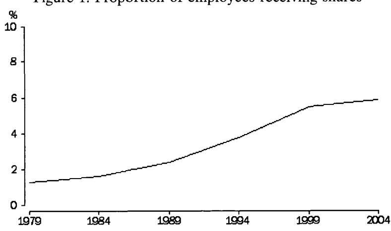
Figure 1: Proportion of employees receiving shares

ABS data indicates that an increasing number of employees are taking up shares as a form of employment benefit. In 1979, the proportion of employees who received shares as an employment benefit was 1.3 percent.<sup>192</sup> Between 1989 and 1999, the percentage of full and part-time employees owning shares in their companies increased from 2.4 percent to 5.5 percent.<sup>193</sup> In 2004, the proportion of employees who received shares as an employment benefit was 5.9 percent.