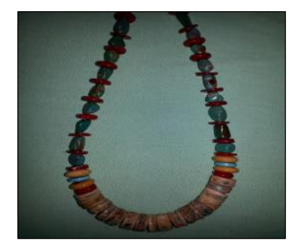
FIGURE 3. 8 BONE, TURQUOISE, AND CORAL BY DAMIEN MONTAÑO