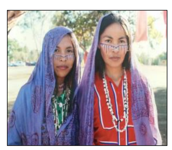
FIGURE 3.9 TWO SERI WOMEN @ PUVUUNGA

these can help individuals re-member something we have not yet experienced in this lifetime. Discussions of sovereignty and recognition are important because artists making jewelry are always practicing at some level a form of sovereignty and resistance. Art has many forms in Indigenous communities in the form of beading or gathering shells and basket materials for basket making and jewelry making.<sup>25</sup> Indigenous rights and sovereignty are of the utmost importance for access to land, the ability to practice continuity in making artistic and practical pieces for the use of the tribe, and to compete and sell their work in a capitalist based market system.