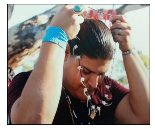
FIGURE 4.2 SNAKE RIBCAGE NECKLACE WITH RATTLE CHARM