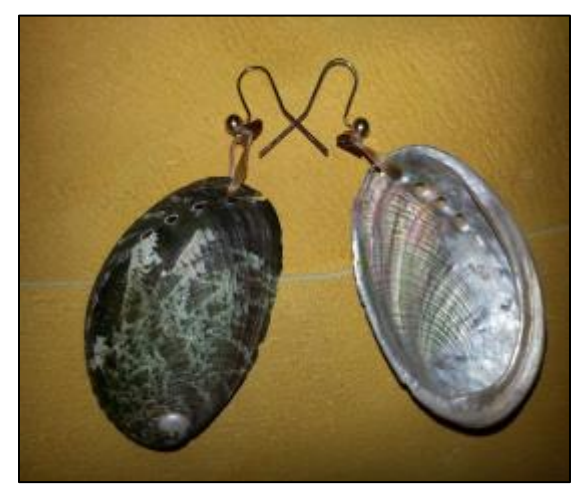
FIGURE 3.7 ABALONE EARRINGS BY DAMIEN MONTAÑO

lifetime. My jewelry making has been inspired by southwestern Indigenous people as some of my favorite materials has been abalone, dentalium, turquoise and bone.