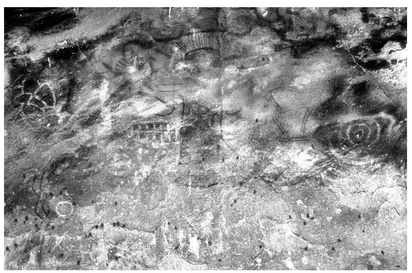
Figure 3. Hyder's photograph of the black "angel-like" figure incorrectly reproduced by Grant (1965).