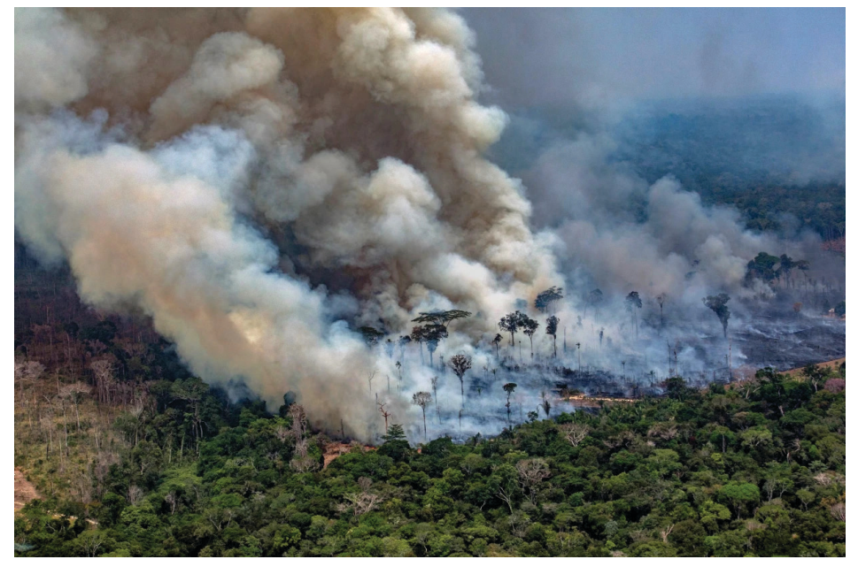
Figure 1: The Amazon as a whole is increasingly deteriorating at the hands of anthropogenically caused wildfires, though the volume of carbon emissions is greater in the eastern region of the forest than the west.

Before human impact on the planet dramatically shifted planetary systems away from energy equilibrium, every forest consumed more carbon dioxide than it emitted. Trees are universally associated with photosynthesis, held in high esteem for "breathing" the air we can't in order to produce a livable environment for land animals. The conversion of CO_2 to oxygen was, after all, needed in order for complex life to develop in the first place. However, in the anthropocene, the new geological era in which human actions have a distinct impact on environmental cycles, Earth is becoming an unlivable environment for trees.<sup>1</sup>