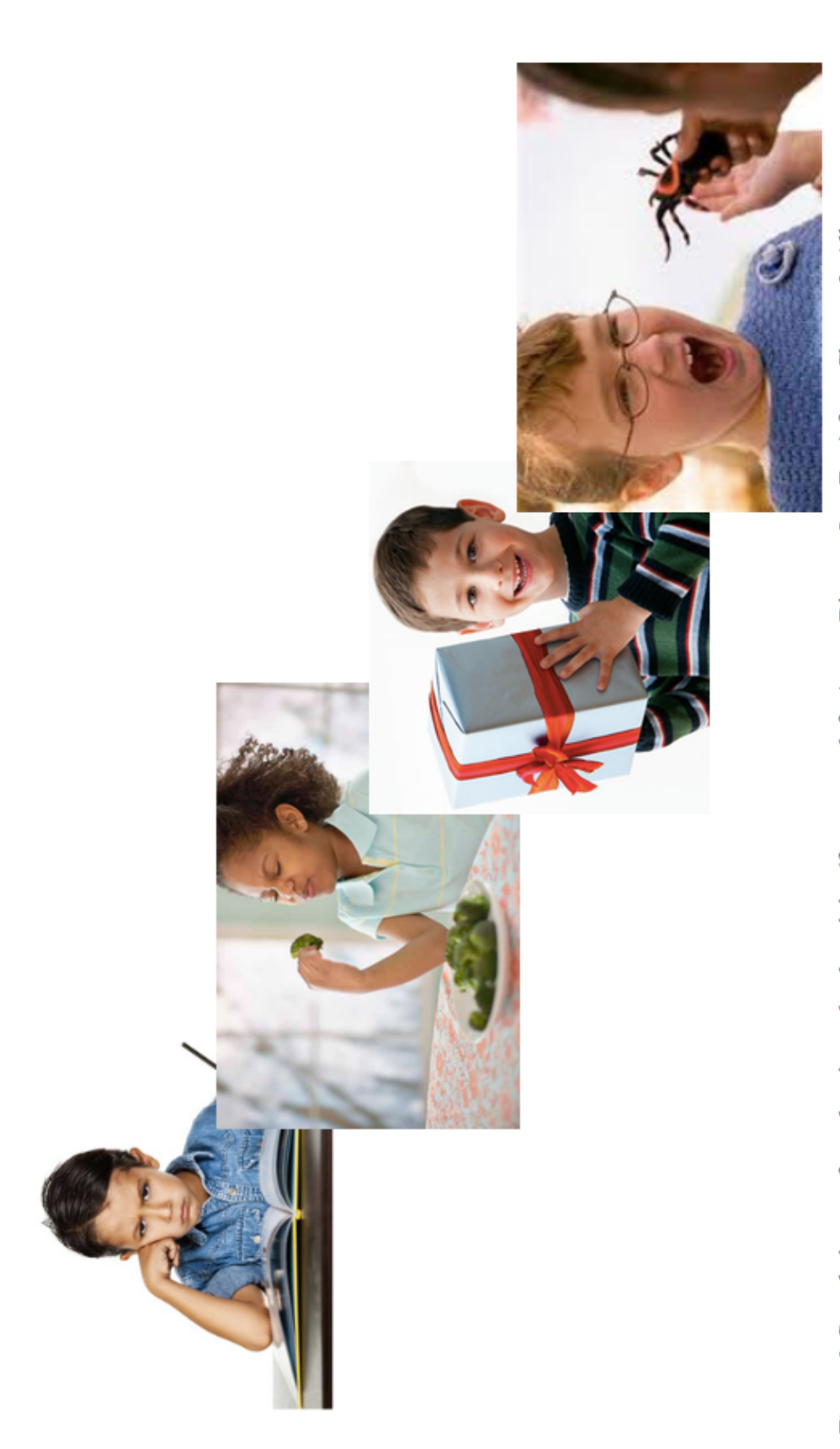
Figure 1. Sample images from the picture book activity (from upper left: Anger, Disgust, Joy, Fear) from Chapter 3. All images were presented in random order, with exception that the same emotion was not repeated sequentially.