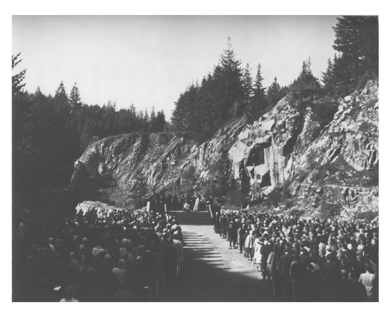
Charter Day Ceremonies Upper Quarry January 14, 1967