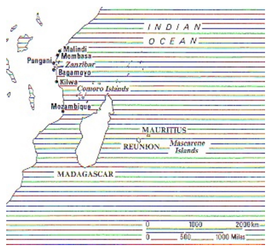
Map 1. The Southwest Indian Ocean

of the slave trade."<sup>6</sup> More recently Sudel Fuma observed at the beginning of this millennium: "The solution for the French was to purchase slaves from a slave trader, to liberate them and to engage them under contract to work in the colonies. This system of repurchase of slaves is in reality one of disguised slave trading."<sup>7</sup> In a similar vein Virginie Chaillou[-Atrous] echoes Fuma's assessment in the following terms: "One must thus conclude that the recruitment of so-called free African workers was only a disguised return, although mitigated by a certain number of juridical constraints, to the system of the slave trade."<sup>8</sup> So when the French sought to revivify the system of "free labor emigration" from Portuguese East Africa in the late 1880s it is no wonder that this decision was met with skepticism by Great Britain.