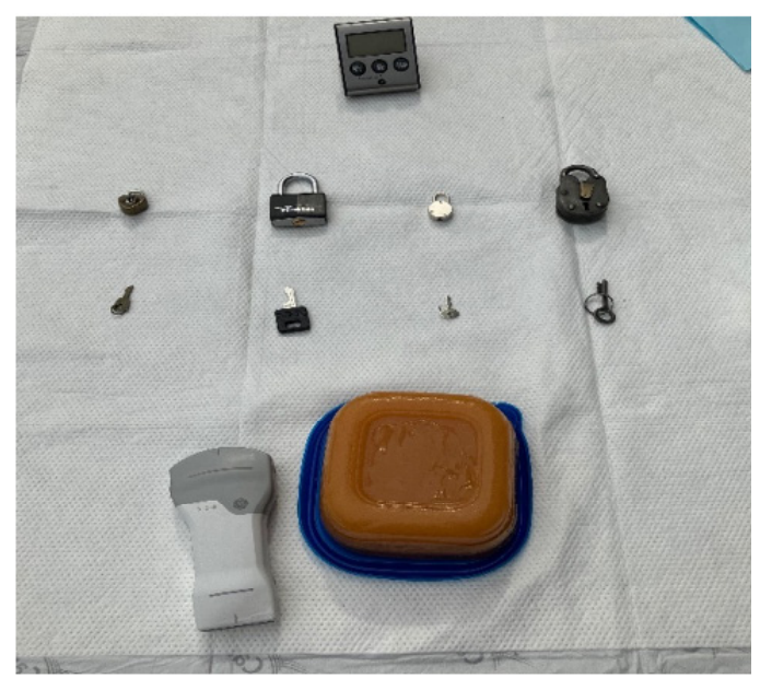
Figure 1. One of four keys was embedded in phantom for US-quided identification.

programs and institutions may not be able to provide residents with the resources needed. Keeping large departments current on activity in the department could increase compliance with scholarly activity requirements.