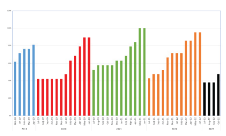
Figure 1. Third year residents new innovations' compliance by class.