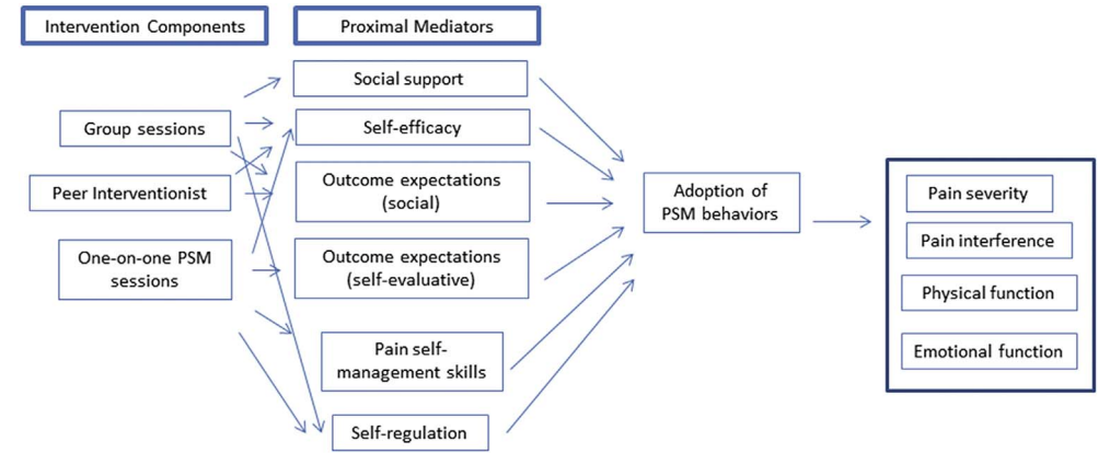
Fig. 1. Conceptual framework for a pain self-management (PSM) intervention tailored to individuals with HIV.

Our qualitative work revealed several key patient and provider