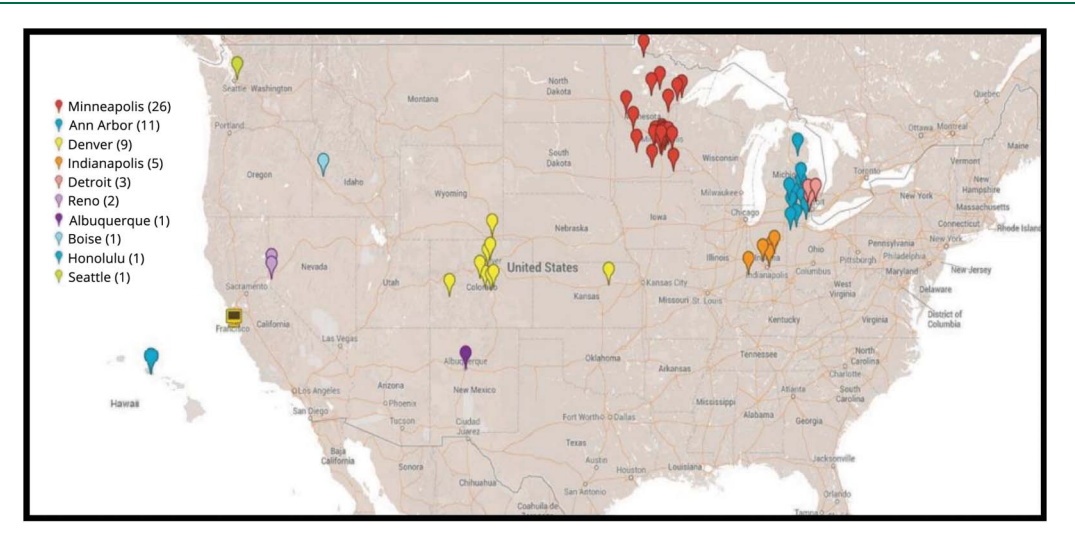
This outlines the home address of each patient who was referred out-of-state for evaluation for DBS. Each color represents the local Veterans Affairs medical center that referred patients to San Francisco Veterans Affairs. These cities are part of the San Francisco Parkinson's Disease Research, Education and Clinical Centers catchment area. DBS = deep brain stimulation.

Figure 1 Home addresses of patients referred for deep brain stimulation