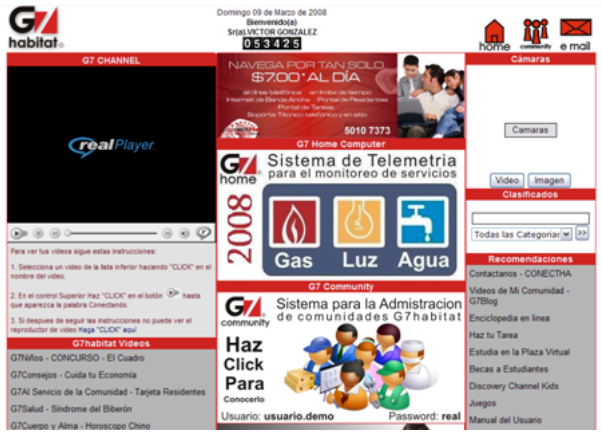
Figure 4. Portal of Real del Sol

The success of Real del Sol's intranet as a community communication and information tools has been modest and fluctuated over time. This can be in part due to Conectha never seeing the intranet as a final product, but more like a platform for innovation, where improvements and changes have been constant. For instance, the tools provided to support communication among neighbours, which at the beginning consisted of a simple page where residents could post messages, has evolved more recently into a complete system for the administration and organization of each privada. Using the system, the residents can record and check the payment of maintenance fees, post information and messages, and coordinate projects with their neighbours such as painting the parking spaces, or planting new trees. Consequently, while the first version of the system was hardly used by neighbour for communicating among them, this new version is frequently used by the presidents of the privada to keep a shared record that makes their administration visible to all residents, avoiding misunderstanding with regards to how resources are used for the projects.