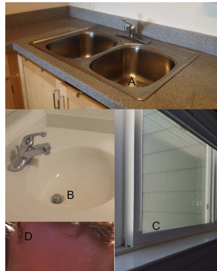
Figure 1. The Study Sites for Surveying Fungi in Residential Units of a University Housing Complex. Pictured are three surface types on what cotton-tipped swabs collected material for fungal analysis. Biofilms were collected on three types of drains: kitchen sinks (A), bathroom sinks (B), and bathtub drains. From the upward-facing edge of windowsills in kitchens, living rooms, bedrooms (C), and bathrooms, dust was also collected. Skin samples were taken from the forehead (D). Fungi on these surfaces were compared with each other and with passively settled indoor and outdoor dust from the same sampling locality [10].

Genomic DNA extraction relied on the MoBio PowerSoil Kit (Carlsbad, CA, USA) with some modifications following Fierer et al. [21]. Using scissors that had been immersed in ethanol and flamed, the cotton head of the swab was cut directly into the provided PowerBead tubes containing solution C1. The tubes were incubated at 65^{\circ}\text{C} for 10 minutes and vortexed horizontally for 10 minutes, after which manipulations followed the recom-