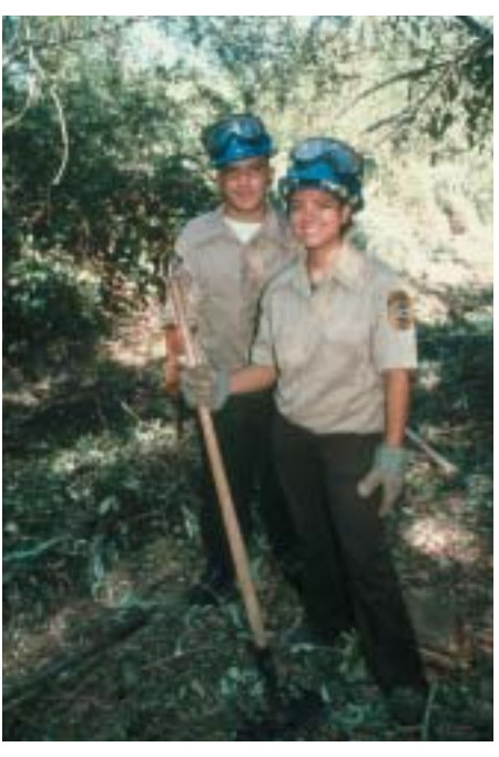
In 2002, about 2,000 CCC positions were allocated among 11 geographical regions. The majority of corps members are male and about 40% enter directly out of high school.

classes to continue their training. Corps members are on their own on the weekends, although the residential districts try to provide healthy activi-