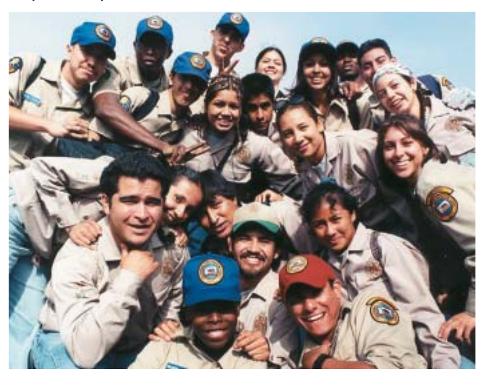
Since 1976, California Conservation Corps (CCC), a state agency, has provided employment for youth and labor for natural resource protection and enhancement. Today many young people also utilize the program for career development. Above, Corps members completed a project at the U.S.-Mexico border near San Diego.

Entering the working world has never been an easy transition, but for young people today it involves many new challenges (see p. 48). Consequently, one would expect the first few years after high school to be a critical time in the lives of young people who do not go on to college. In today's labor market a college education is frequently required for work that can provide a decent income; as a rule, high school programs generally focus on preparing youth for college (Glover and Marshall 1993). However, in California, only 50.5% of students graduating from high school in 2000 entered a 4-year college program directly after high school, lower than the national average of 62.9% (Children Now 2001).