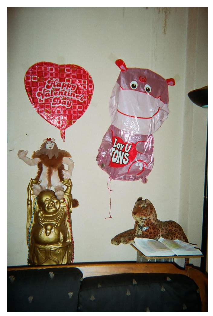
Figure 3.4

"It's real soothing. I don't have it my place now, but I have one area that I just visualize. And sometimes I find myself chanting more than I actually may wanna go hear a sermon. Because it's soothing, and it helps. And I know that, since I been diagnosed—AIDS, disabled and AIDS, you know, my stress level, my patience and my tolerance with people...or, the things that's going on in my life, my tolerance, it's...I can manage it. You know, I still don't really like people, but I have more care for them. You know, chanting, it's like a world peace type of thing. And it's like a customized religion for me, where I can customize it and chant for the things I want changed in my own self, person, or my life. And it works."