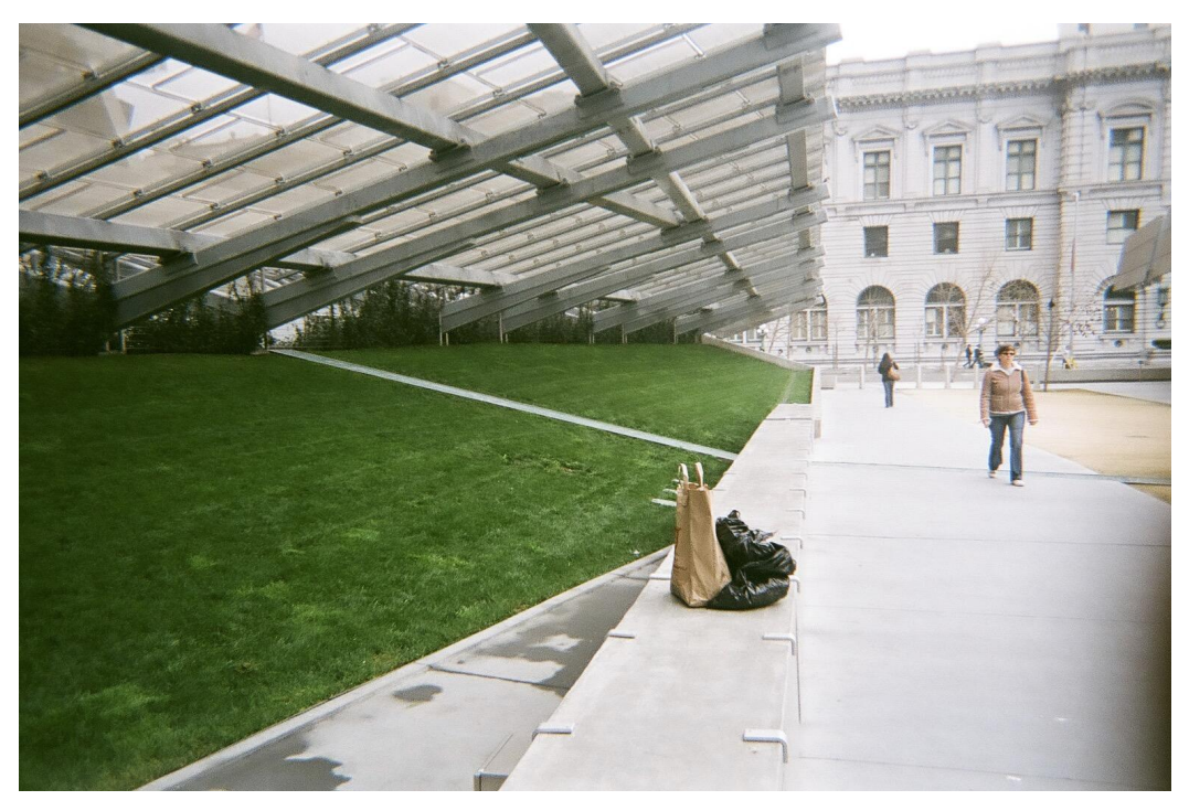
Figure 3.1

For those women who did not have consistent access to necessary resources, providing for themselves and their families dominated the majority of their time and energy in their daily lives. Participants described being unable to focus on other priorities in their lives, given the stress involved in seeking security while meeting their daily obligations and commitments.