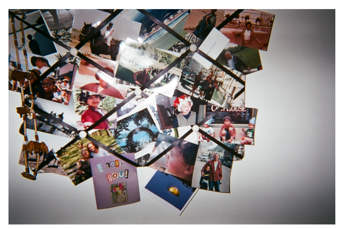
Figure 3.11

"This is religion in my daily routine, these people are my family and my long-term friends...this is really religion for me. They all have different attitudes, they all have different ways, for me, this is my church. dealing with them, learning to accept them, learning to love them exactly as they are, this is my religion. And its personal, just for me for my spirit. These are the people I love and embrace. This is it every day."