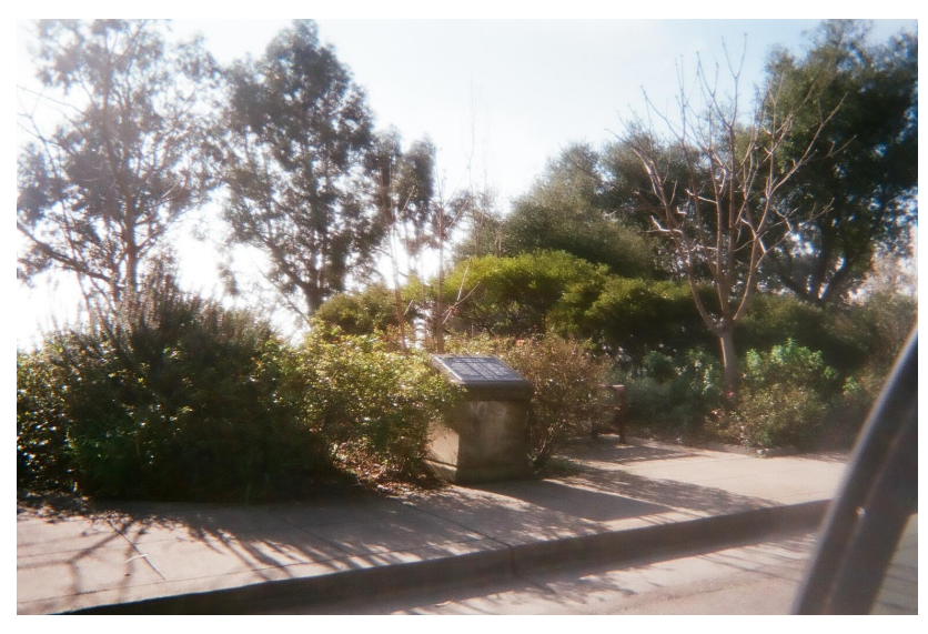
Figure 9

"The greenery, the natural environment – they settle with me."