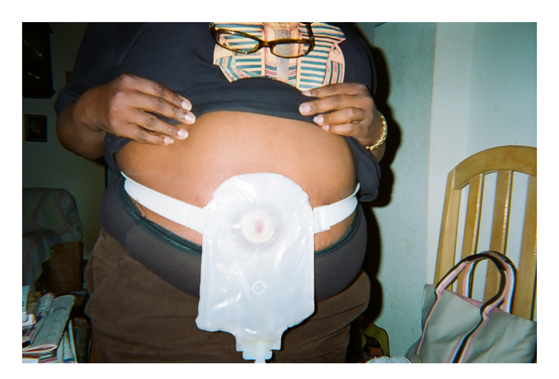
Figure 3.6

In addition to protecting themselves from potential judgment, participants described a desire to manage the expectations that others may have for them. Particularly when participants were rearranging their lives to accommodate changing abilities, sickness, and depression, they were less likely to be able to meet the needs and expectations of other people. While most participants described difficulty navigating the routine obligations of their social roles, many also described facing new expectations from family, friends, and community in regards to how the participant responded to her illness. Multiple women described that the same people in their lives who offered them support throughout their illness also had specific ideas for how they should behave and interpret chronic illness and its medical treatment. In particular, participants felt that their support networks were assessing their work to recover or ameliorate the negative impact of disease. The people who were most involved in supporting a participant in