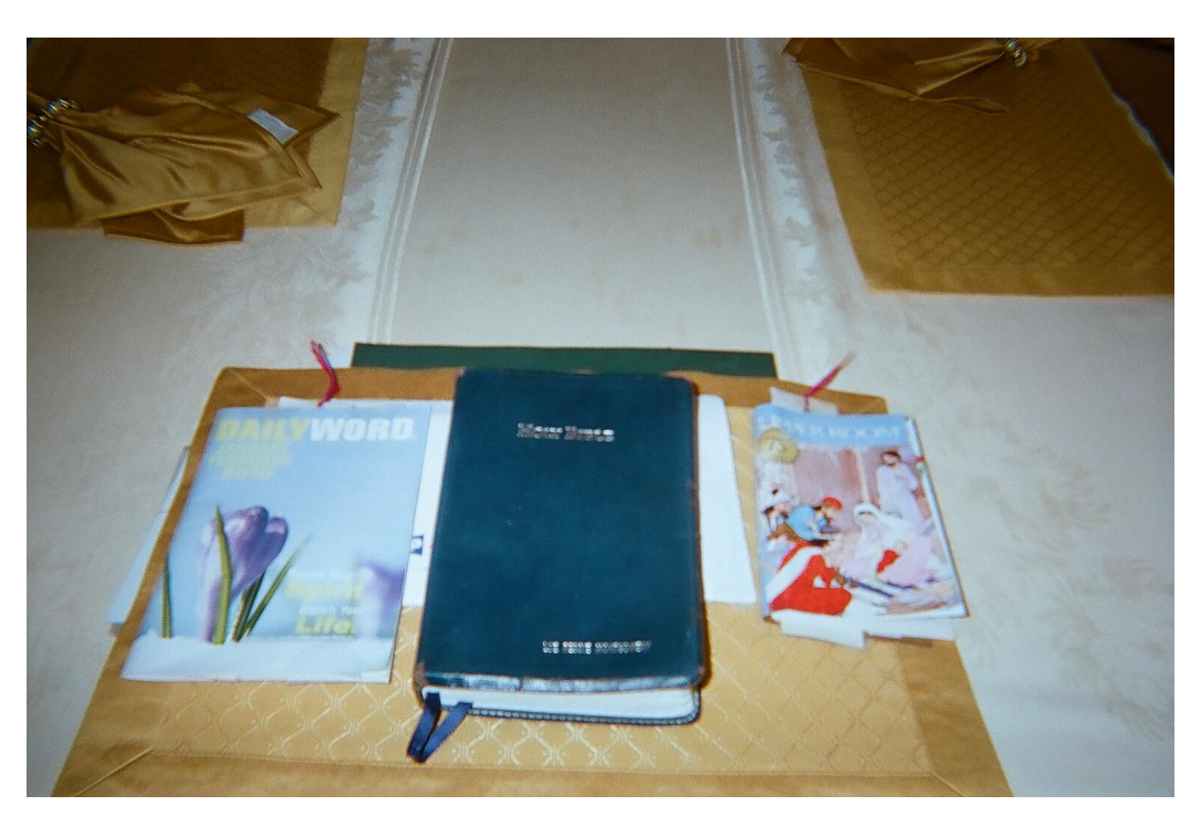
Figure 3.3

"I try to do it when I start my day, before I get out the bed, I get into my clothes, the first thing I wanna do is get my two books and the Bible, go through every day—it's isolated by days, and each one have a different devotion, so I will read those, and then it refers to a Scripture reference, I will go to the Bible, read that Scripture lesson. What it does is it has a real, real calming effect—as my husband used to say, the minister, he used to say it gets your day started, you begin it in a different tone, a mindset up here, you are more relaxed, you are just sort of in sync with yourself, and with the Spirit...But it has a very positive spiritual—a connecting, reconnecting effect on you. So it puts you in sync with God again. Reconnecting."