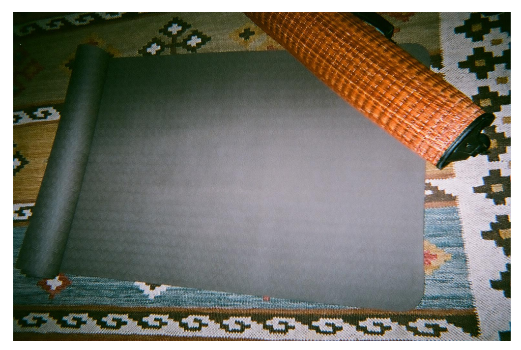
Figure 3.7

"Physical recovery is for the fullness of my life, I'm motivated by honoring all parts of my life and that's totally church for me – honoring that this was part of my journey, for me to learn, for me to grow from."