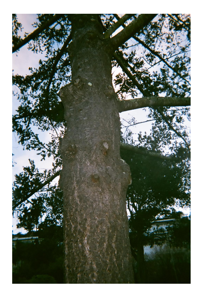
Figure 3.10 "I think one day I was praying and looking at the sky."

No matter where they found ways to interact with the natural world, each of the women interviewed intentionally included these stories. Their narratives reference the natural world as a source of peace and consistency, sometimes in specific comparison to the nature of illness as arbitrary and unbiased.