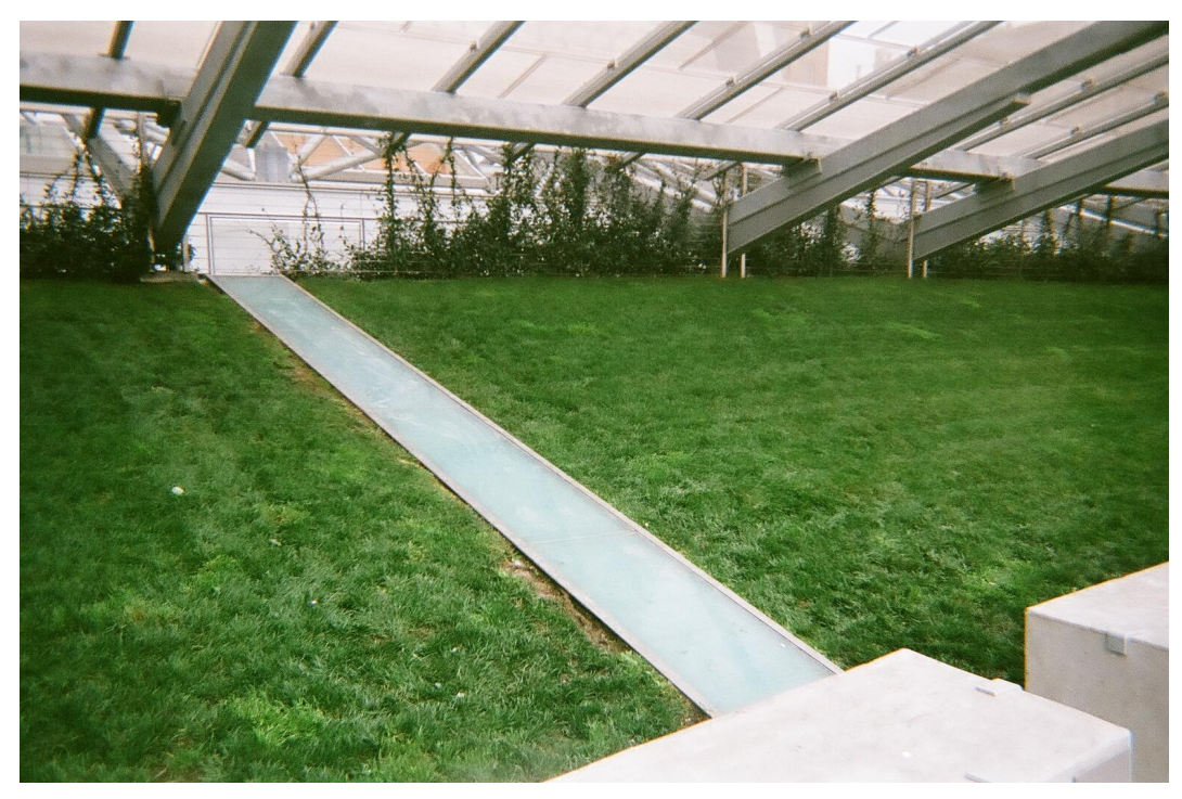
Figure 3.8

"The greenery, the natural environment – they settle with me."