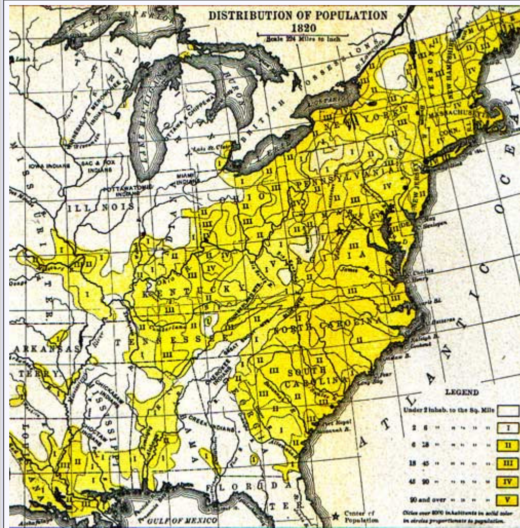
This map is from Semple's American History and Its Geographic Conditions (1903). The map shows the influence on westward population movements of rivers, lakes, national roads, swamps, Native American land and fertile soil areas.