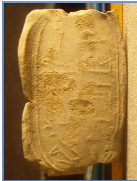
Figure 1. Seal impression found at el-Lahun mentioning the office of a vizier. UC 6710.

From administrative documents, but also from contemporary monuments, it becomes clear that having double names was common in this period (Vernus 1986). This may be seen in relation to the general trend of this period toward greater control, already visible in the more precise titles and the larger number of sealings used in administration.