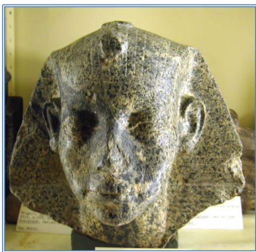
Figure 3. Head of a statue showing Amenemhat III. Petrie Museum UC14363.

protected by an elaborate closing system with huge blocks closing the gangways and a burial chamber made of two monolithic blocks. Most pyramids of the 13 th Dynasty copied this system (Theis 2009). The pyramid complex included a huge building, later known as the “Labyrinth” and described by several classical authors (Blom-Böer 2006).