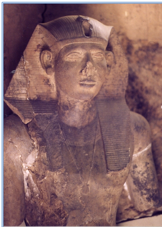
Figure 6. Statue of King Neferhotep I. Cairo 42022.

No such evidence is available for the reigns of Wahibra Ibia (Ryholt 1997: 353 - 354) and Merneferri Aye (Ryholt 1997: 354 - 356). The latter king is the last attested on monuments from Upper and Lower Egypt. The pyramidion of his pyramid was found in Tell el-Dabaa. All following kings assigned to the 13 th Dynasty are only known from monuments found in Upper Egypt (Franke