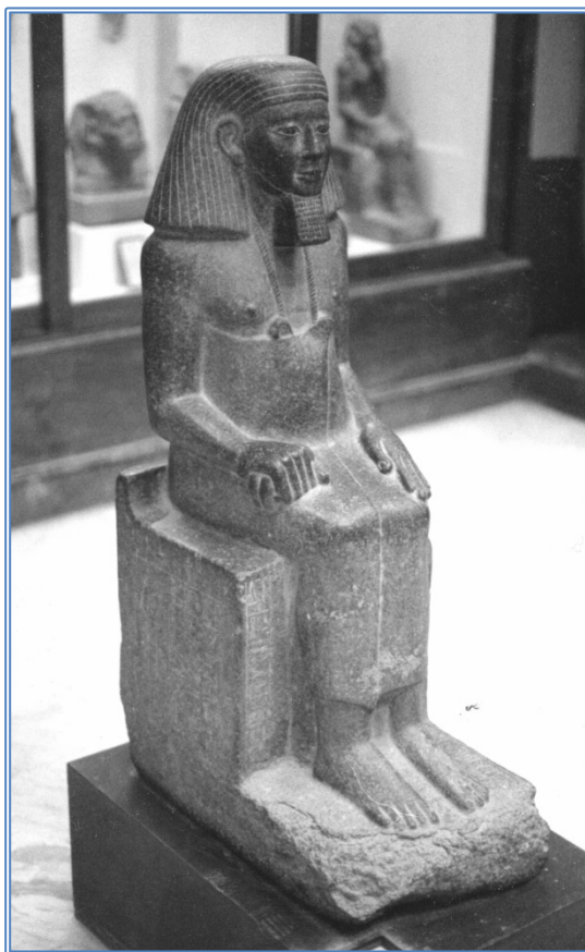
Figure 5. Statue of a 13 th Dynasty vizier. He was the father of vizier Ankhu, but his name is lost. Cairo CG 42034.

served, and that enables the reconstruction of a dense network of officials (Franke 1984: 16).