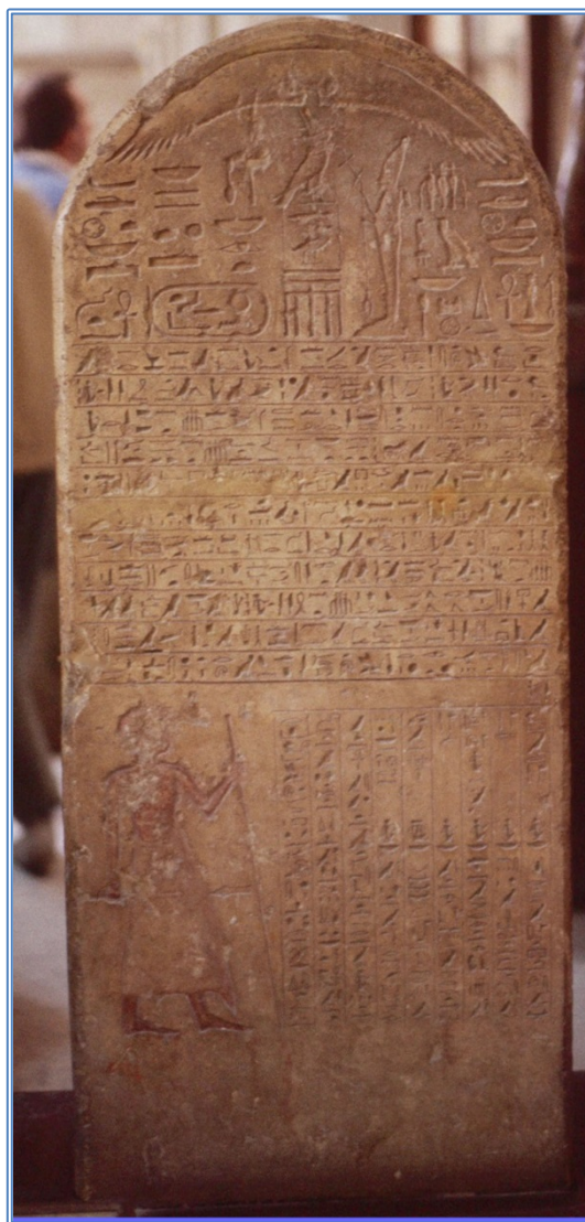
Figure 2. Stela of Shetepirra showing a deity in the roundel. Dated to Amenemhat III. Cairo CG 20538.

Several late Middle Kingdom town sites have been at least partly excavated and provide valuable information on the living conditions of the population. Hetepsenusret (el-Lahun) and Wahsut (at Abydos) were planned towns on a grid pattern with large houses for the ruling class in one quarter and smaller ones in others (Quirke 2005; Wegner 1997).