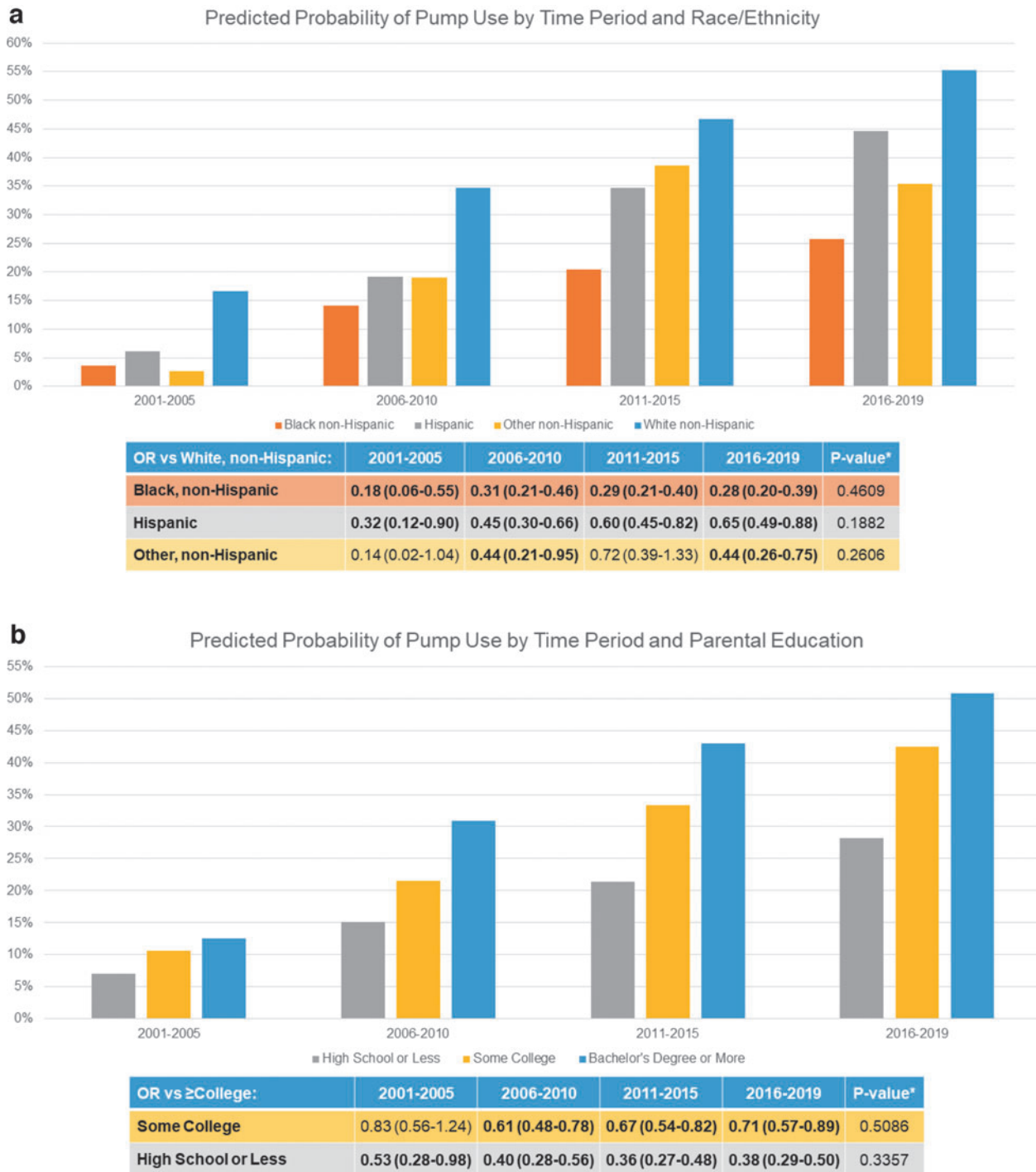
FIG. 1. Adjusted predicted marginal probabilities and odds ratio for pump use over time by our subgroups of interest. (a) Race/ethnicity, (b) Parental Education, (c) Household Income and (d) Health Insurance. Figures show adjusted marginal prevalence (column graph) and adjusted odds ratio (table) for insulin pump use by patient characteristics and year. * p -Value for statistically significant differences in prevalence for pump use between period 1 (2001–2005) and period 4 (2016–2019) is noted in the table.

A limitation of this study is that much of the SEARCH data are self-reported through questionnaires and so there is a potential for recall bias, although this may be less likely for key variables such as insulin pump use. Also, we were unable to capture any change in insulin pump use that occurred between visits. Although the surveillance population of SEARCH for incident diabetes was similar to the U.S. Census