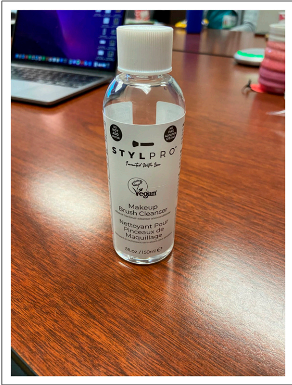
Figure 1. Bottle of the makeup brush cleaner.

veno-arterial (VA) ECMO on HD 1 (Figure 2(c)) requiring maximum support with a cardiac index (CI) of 2.5 L/min/m 2 . On HD 2, she received a single dose of surfactant (Curosurf) 2.5 mL/kg by endotracheal lavage with an immediate decrease in ECMO support need from a CI of 2.5 to 2.0 L/min/m 2 and a 10% reduction in ECMO FiO 2 need within 2 hours. The peak inspiratory pressure (PIP) was also able to be weaned within an hour of surfactant administration to maintain the same tidal volumes on the ventilator. She was successfully decannulated after 72 hours of ECMO (Figure 2(d)).