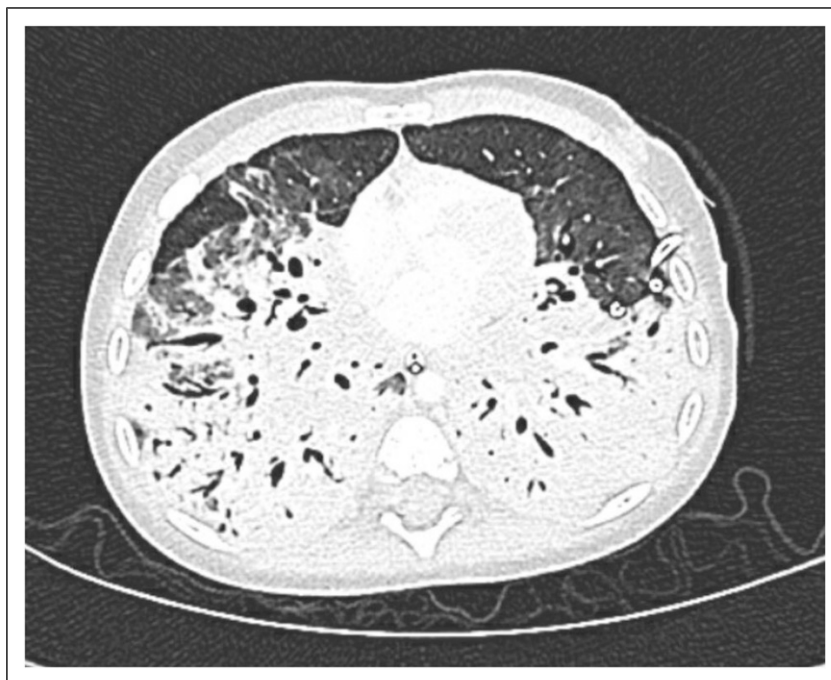
Figure 3. Chest CT on hospital day 11 demonstrating bilateral lower lobe lung necrosis.

also have widespread use in paint thinners and other petroleum distillates such as furniture polishes, solvents, and cleaners. 2 The clinical course of accidental hydrocarbon aspiration or inhalation is usually mild with coughing, vomiting, and central nervous system depression as common presenting symptoms. 2 Severe cases of a rapid chemical pneumonitis, ARDS, and multiorgan failure are more classically described with exposure to kerosene and paint thinner exposures. There are no known demographics or clinical factors that are significant prognostic indicators of disease severity. 2 The severity of the clinical course in this case is unique due to what is generally thought of as a more innocuous household source - an organic makeup brush cleaner.